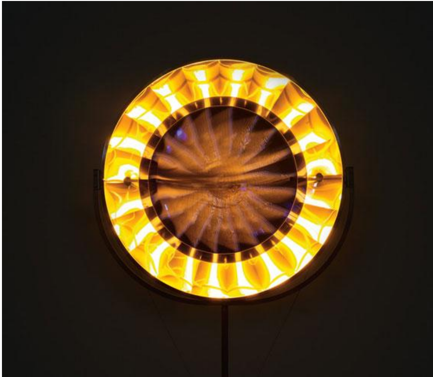
Figure 1: LouisVuitton x Eliasson Eye See You

The emotional and affective charge of the window design is engaging and powerful. By representing the eye, quite literally, we see how this collaboration questions the very nature of the shop window as a space for looking at commodities. In a striking inversion of the gaze, the 350 Louis Vuitton windows display nothing but the illuminated monochromatic pupil of an eye, watching, following, surveilling. The eye-light is so bright that it is difficult to look at and the remainder of the window is shrouded in blackness. In this daring switching of the relationship between viewer and viewed the consumer sees nothing. The eye sees you. The installation, as a metaphorical eye with an indifferent and/or aggressive relationship to moving viewers effectively speaks to a number of conceptual debates about the gaze, the relationship between watcher and watched, consumer and store, surveillance and social control (Modigliani, 2007). The relations between art and fashion provocatively reveal how on the one hand, fashion can “transform places and spaces, adding, deferring or altering the identity of the environment, while, on the other hand, it can increase the cachet and cultural