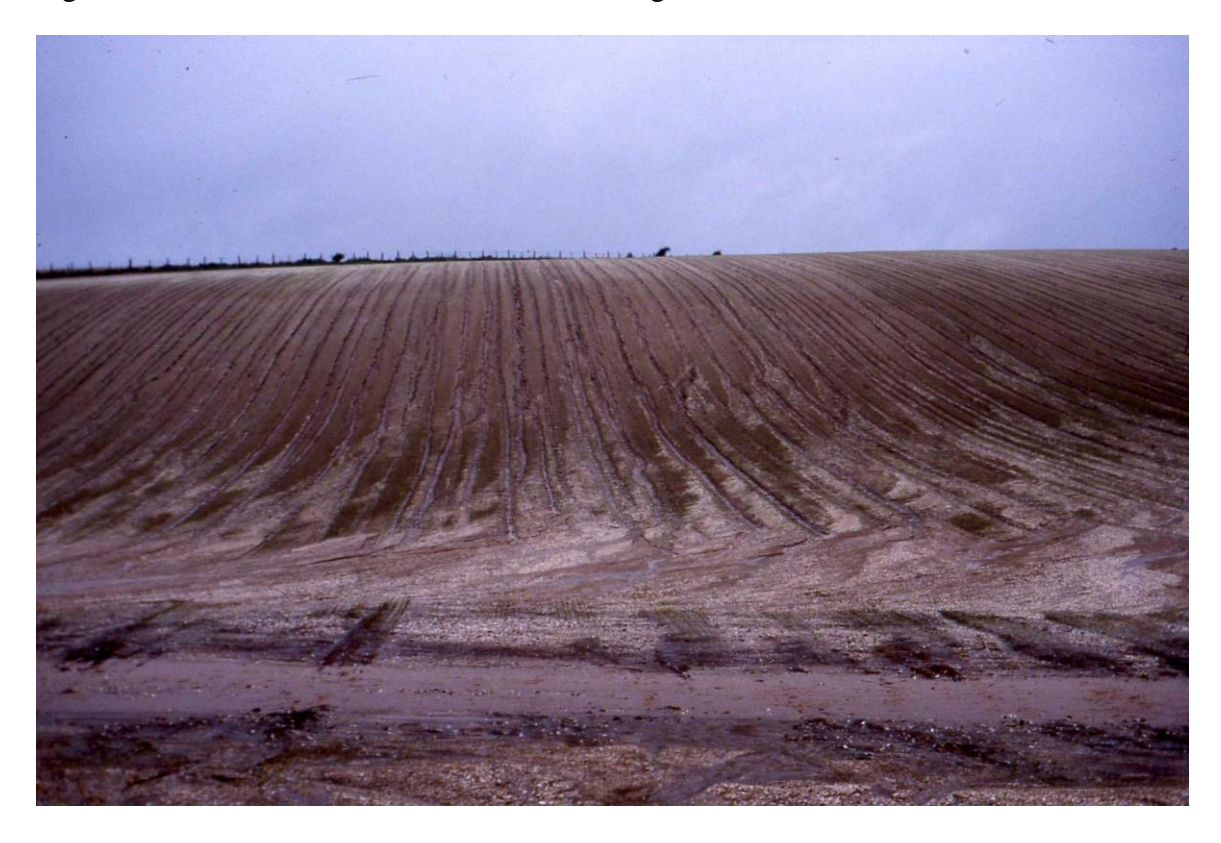
Figure 2a. Erosion on winter cereal field, Rottingdean, 1987

Figure 2b. Off-site flooding from winter cereal field, Lewes, 1991