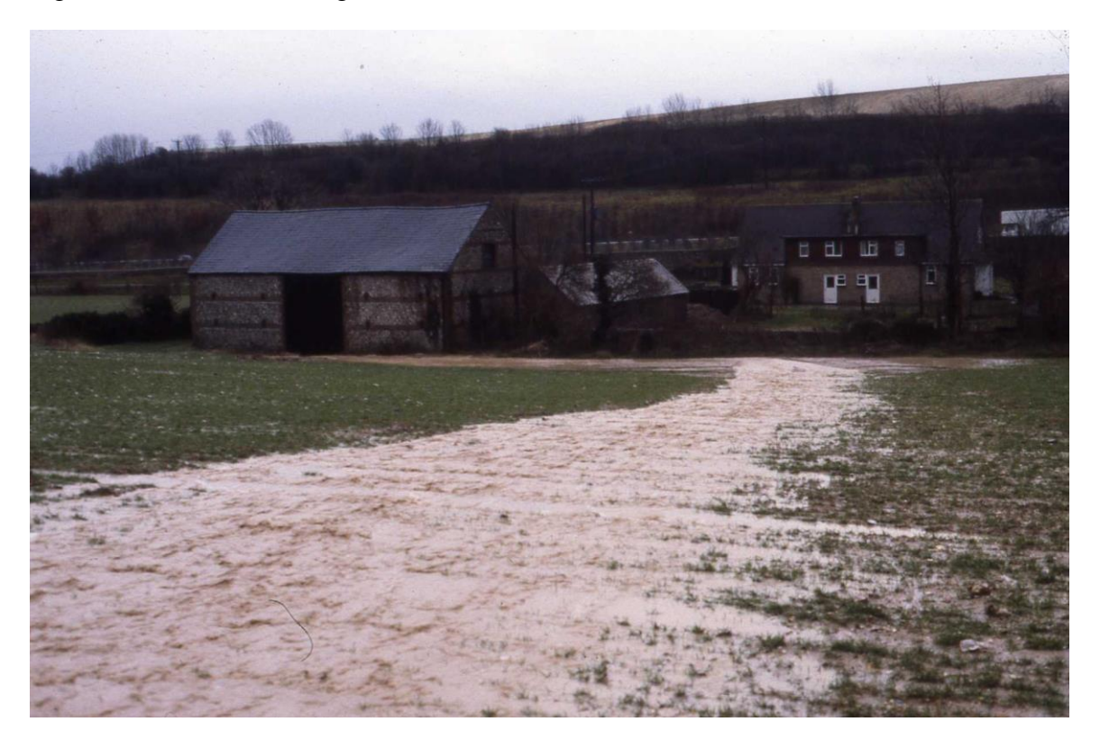
Figure 2b. Off-site flooding from winter cereal field, Lewes, 1991

Figure 2a. Erosion on winter cereal field, Rottingdean, 1987