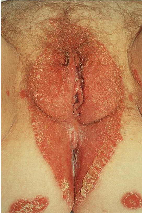
Figure 3: Psoriasis affecting the female genitalia. Well demarcated erythema surrounding the anogenital area with typical psoriatic plaques in surrounding skin. The genital plaque has typical scale in the perianal area, but lack of scale in the perineal and vulval areas.