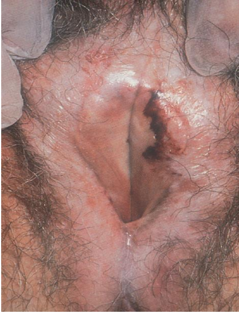
Figure 5: Advanced vulval lichen sclerosus. Whiteness, loss of anatomy, ecchymosis seen on the left labia, scarring over the clitoral hood