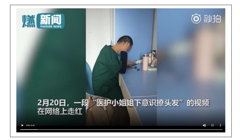
Figure 2. Screenshot of a video posted with (d) ( Headline News , February 20th, 2020) – text in the screenshot translates to: 'On February 20th, a video of 'a young girl medical worker unconsciously tried to pull her hair up' went viral'.