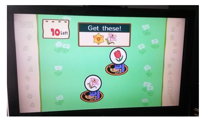
Fig. 4. BBA for Wii example game Whack Match.

The brain weight metaphor is clearly seen in the graphical/animated display of a brain and scales (Fig. 2 and Fig. 3).