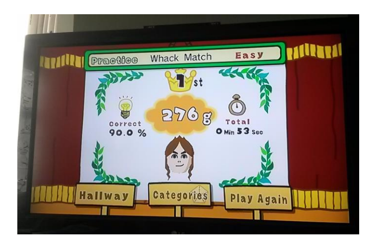
Fig. 5. BBA for Wii ranking on enrolled player's TV.

An additional screen is shown after login which contains a summary of the entire play record since enrolment on the BTS. This is presented as Exercises Completed, Sessions and Total Time (hh:mm) for the current calendar week (Sunday to Monday), the current calendar month, the calendar year, and a total (which allows for annual play across year boundaries). Sessions are continuous plays (most likely determined by browser session) and Exercises completed are the number of mini-games played.