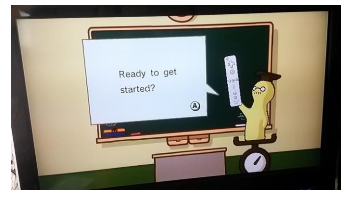
Fig. 2. BBA for Wii teacher avatar on a enrolled player's TV screen, introducing game and demonstrating Wii Remote.

The setting and overarching narrative for the game is a school where players are enrolled as students who train and take tests to improve their 'brain weight', whose endeavours are led by a teacher avatar, headmaster Professor Lobe (see Fig. 2).