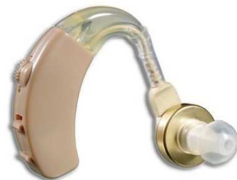
Figure 1. GN ReSound Aventa software for programming HAs (left). Note the complexity of the programming environment and of the various calibration options, as opposed to the two simple controls/settings on a basic analogue HA (right).

Traditional gaming technologies have been successfully employed in non-leisure scenarios for learning and skill acquisition, empowerment and social inclusion [1][2]. Studies have shown that games have benefits for enabling familiarisation of products specifically for older users [3]. Dryburgh [4] notes that the use of technology is self-taught by either watching others, asking advice from others, trial and error, or reading the manual. For many people none of these methods are satisfactory, especially when it is hard to develop a mental model of how a particular device works. Darzentas et al. [5] describe how a game-based approach can be applied to the process of device familiarisation to provide motivation and reduce anxiety and uncertainty associated with the use of technology. Further, digital games have largely done away with manuals, with the familiarisation process now built into the gameplay [6].