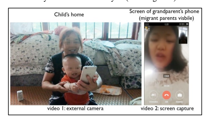
Figure 1: Our approach to video capture

The video recordings were conducted on the children's side, i.e., in the rural areas. A researcher was always present in the field to set up the camera equipment before participants started their calls. Each video call was recorded, firstly, with a traditional camera recording the interaction in front of the mobile phone (e.g. [30]) and, secondly, through a screen capture of the grandparents' mobile phone (e.g. [19]). This method of recording made it possible to capture all three parties in the video communication: remote parents, grandparents and left-behind children. Both video streams were then synchronized for analysis (as in Figure 1).