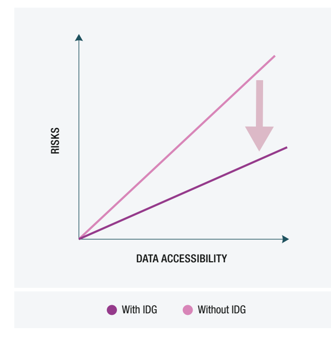
Figure 2. Data accessibility versus risks associated with sharing

This figure shows the reduction in risks (arrow) associated with data sharing and accessibility as a result of proper international data governance (IDG). Without IDG, the risks increase at a higher rate than with IDG (pink). Clarity and facilitation of understanding of regulations helps mitigate risks to individual researchers and institutions.