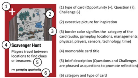
Figure 1. Example Opportunity Card with labels.

Mixed reality games combine real environment with digital content. Examples include location-based games such as Geocaching [41,42], Zombies, Run! [46] and Pokémon Go [43]; mobile augmented reality games such as ARQuake [48] or TimeWarp [8]; and artist-driven experiences like Can You See Me Now? [6]. We employed a previously designed and well-used deck of ideation cards for teaching the design of such games known as ‘The Mixed Reality Game Cards’ [53]. These cards distilled key guidelines from the literature (e.g. [16,38,47,52]) before being iteratively refined through use by over 200 game students, industry experts, experienced academics and artists. We were therefore dealing with an established, comprehensive and widely used ideation deck.