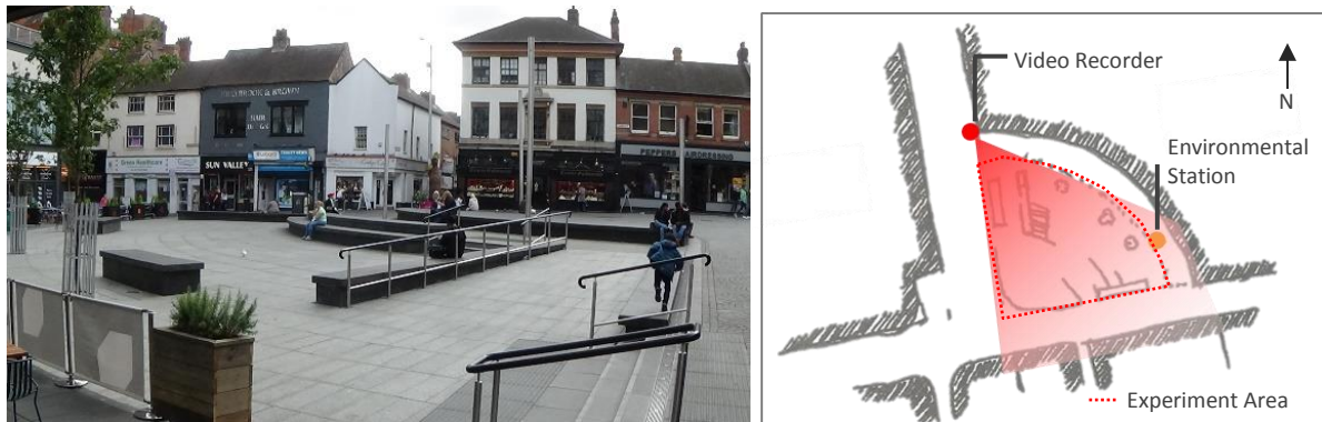
Figure 1 – Left: Photo of Trinity Square. Right: Sketch Plan view with the location of the Environmental Station, Video Camera and Area Evaluated.

presented exclusion, the next day was selected. The exclusion criteria were established to limit the sample to ordinary conducts of human behaviour in public spaces.