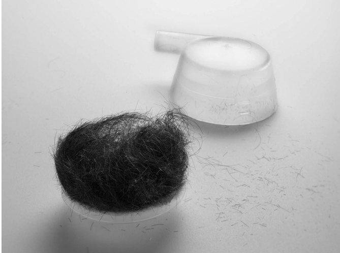
Fig 3. Picture of opened collection filter cassette, demonstrating large volume of clipped hair captured during clipping process using surgical clippers fitted with vacuum-assisted hair collection device (SCVAD).

may pose a risk for contamination of the operative site. The investigation documented that postclipping cleanup of the patient's skin and surrounding adjacent surface areas can be eliminated by using a clipper with vacuum-assisted technology, sequestering clipped hair particles within a closed container, resulting in substantial time savings before perioperative skin antisepsis and draping. The investigation also demonstrated a mean increase in TEWL following hair clipping with SSC and cleanup of residual hair particles using surgical tape. An increase in TEWL suggests that following repeat applications of surgical tape to skin test sites, structural changes occurred that affected the moisture balance in the outermost portion of the stratum corneum. TEWL is by convention used as a marker for skin barrier function that in the present study was altered during postclipping cleanup. The removal of residual hair with adhesive tape often required multiple passes to ensure complete removal of clipped hair from the surgical field before skin antisepsis. When the tape was sampled for microbial burden, a mean colony count of 3.9 Log 10 CFU and 4.6 Log 10 CFU was recovered from the chest and groin, respectively, suggesting that clipped hair can be a significant source of bacterial contamination within the surgical field.