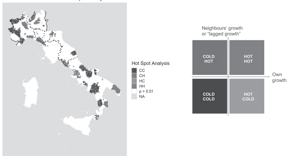
FIGURE 2 HOT SPOT ANALYSIS—LOCAL MORAN STATISTIC OF 1861–71 POPULATION GROWTH

Notes: The left panel maps the statistically significant clusters found when computing the local indicator of spatial association (LISA) at the municipality level. The indicator used is the local Moran statistic. The weights are row-standardized and computed with proximity measure \frac{1}{\sqrt{w_{ij}}} , where w_{ij} is the walking time between municipality i and j . The right panel represents the types of spatial associations that can be found in a Moran scatter plot. Data sources are described in the main text.