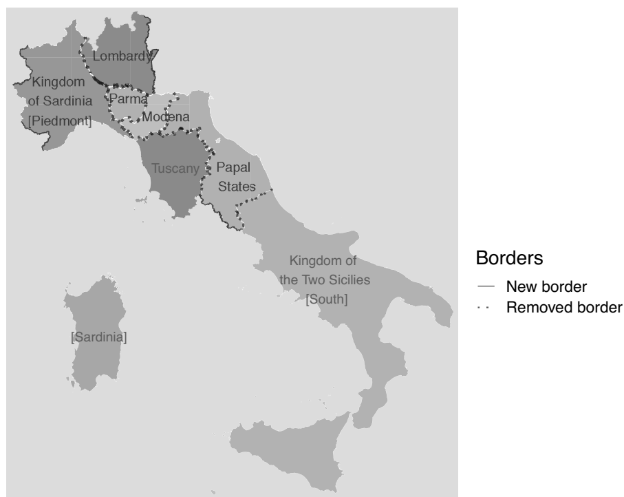
FIGURE 1 ITALIAN STATES BEFORE UNIFICATION WITH REMOVED AND NEWLY IMPOSED BORDERS

Note: This map shows the states that were united in the Kingdom of Italy (at its 1861 borders).