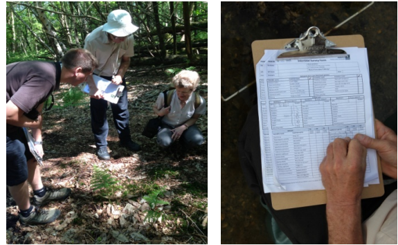
Figure 4 Amateur naturalists surveying species on paper

The emotional attachment to their work is also reflected in the professionals' view of surveys and the tools used for surveying. Despite the advances and availability of technology in this digital era, professionals tend to conduct