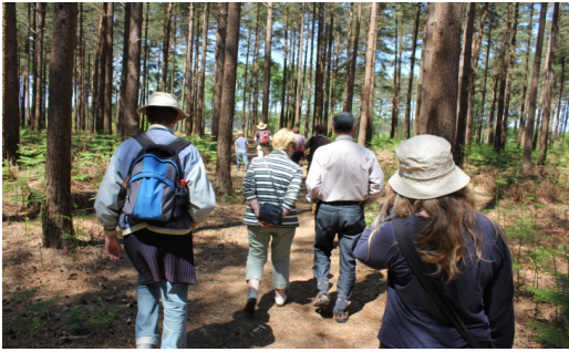
Figure 3 Bio Blitz in the New Forest National Park

Amateur naturalists self identify with the term and distinguish themselves from the professionals despite the fact that sometimes they are just as knowledgeable as a result of their long-term engagement with species recording. Very often, they are locals, residents near a park area that work closely with the county recorders in regular, organized group surveys or people who just record things on their own while walking the dog.