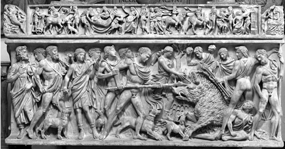
Figure 9.2: Calydonian hunt sarcophagus. Rome, Palazzo Doria.

attributes distinguish the group of sarcophagi showing Meleager's death from other depictions of the hero: on the sarcophagi that depict the Calydonian hunt in full action Meleager is never shown using any weapon other than his spear, and never even wears a sword strap around his upper body (Figure 9.2). 23 The same is true for all his fellow hunters. 24