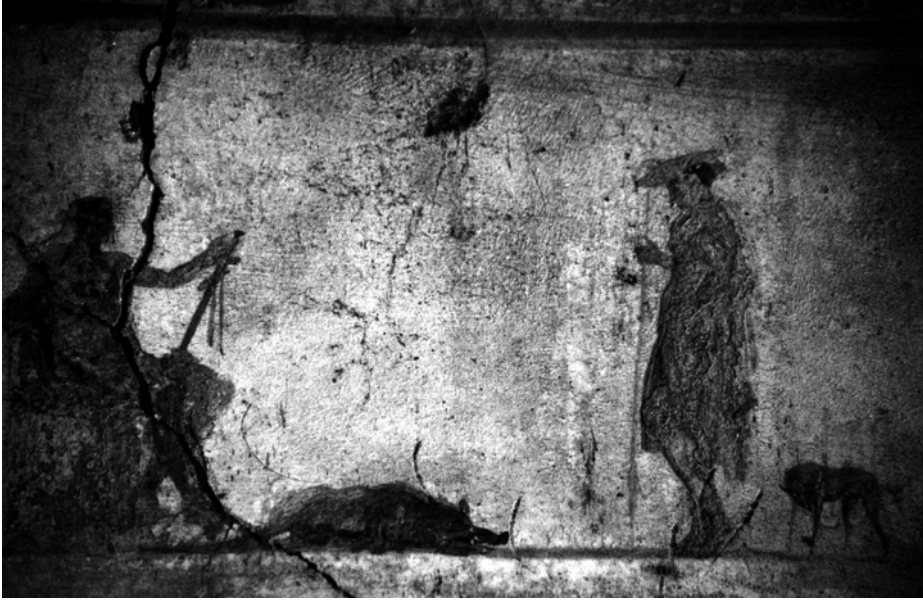
Figure 9.8: Meleager and Atalante. Pompeii, Villa Imperiale.

attribute in order to add a layer of military virtus to Meleager, elevating him out of the context of the ordinary hunter and into the role of a manly warrior. 62 This is the same strategy which can be observed later on the sarcophagi.