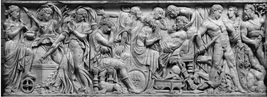
Figure 9.1: Meleager death-bed sarcophagus. Paris, Musée du Louvre MA 654.