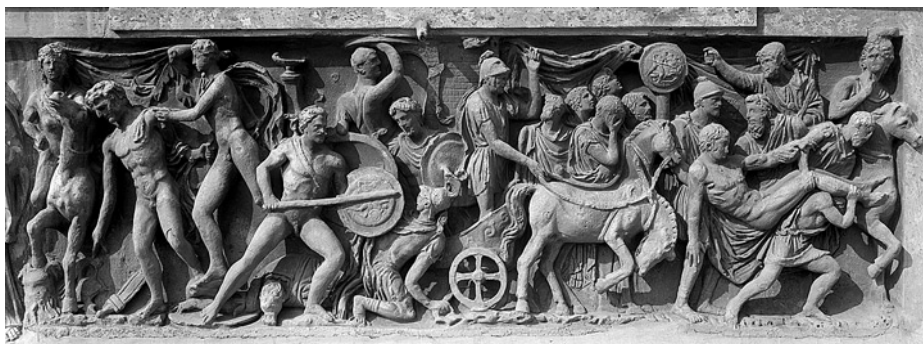
Figure 9.3: Meleager recovery sarcophagus. Rome, Villa Doria Pamphili.

uncles. The curse his mother subsequently puts on him makes him avoid further fighting, but when his city is threatened, he enters the battle again and is then killed by Apollo. 26