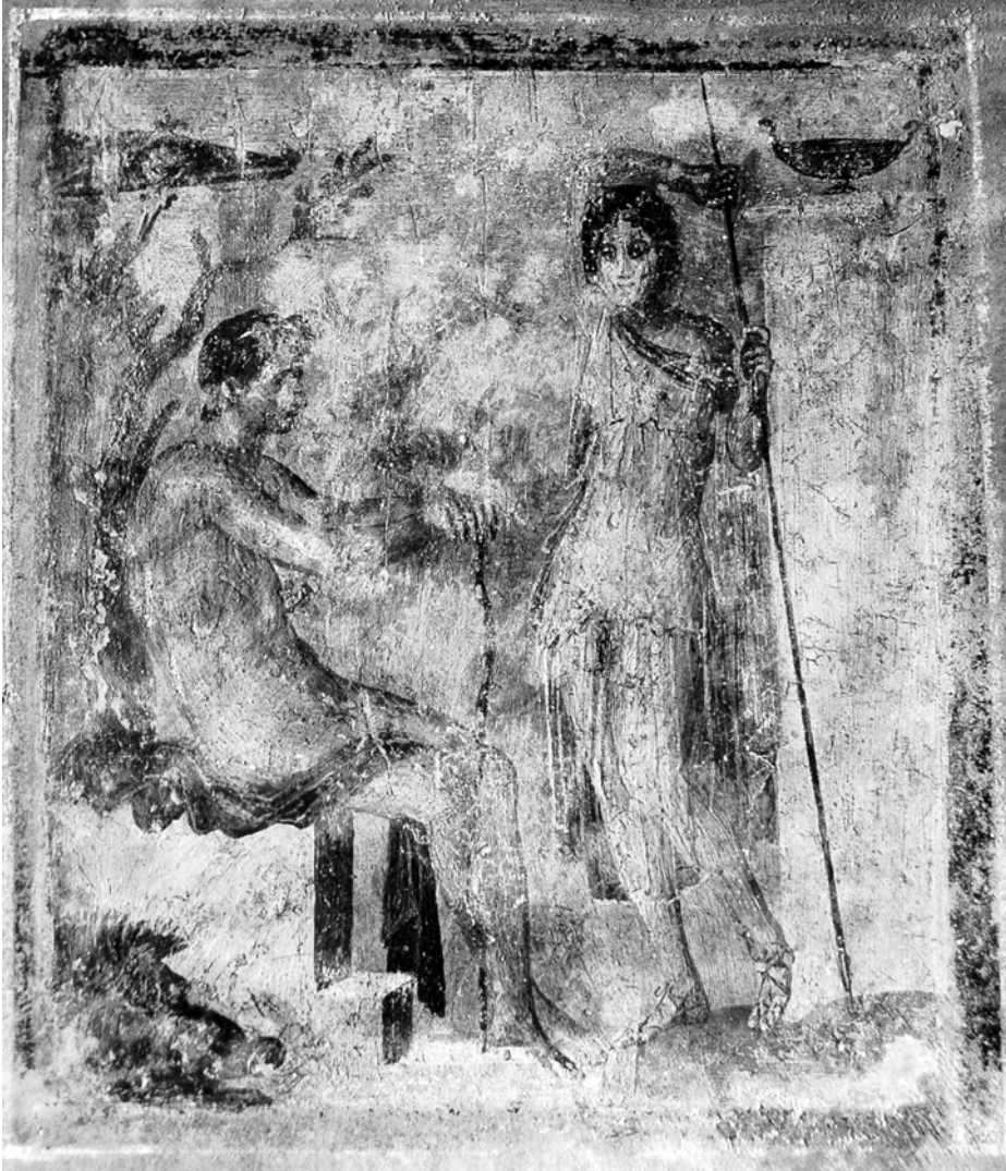
Figure 9.9: Meleager and Atalante. Pompeii, Casa della Venere in Conchiglia (II 3,3).

Romana repertoire but using the visual template of another myth, and the selective use of the Moirai -cum- Erinyes -cum- Nemesis figures. The relief demonstrates a familiarity with, and an interest, in the sphere of the virtual that is not even matched by the scenes of the Calydonian hunt which are much more strongly based within the realm of myth.