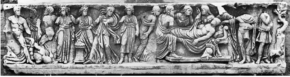
Figure 9.7: Meleager death-bed sarcophagus. Castel Gandolfo, Villa Barberini.

figure of Althaia, providing the reason for her state, while at the same time offering a parallel visual of mourning. The only figures on the frieze which are not exposed to shifting narrative and descriptive values are the Moirai . While everything else on the frieze is up for debate, they provide a constant frame of reference, which tells of an unchanging direction leading to the ultimate fate, which is death.