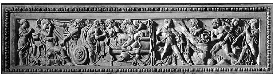
Figure 9.6: Meleager death-bed sarcophagus. Rome, Museo Capitolino 623.

sarcophagi (Figure 9.5). 41 And it also bears reference to the scene of the loving get-together between Meleager and Atalanta that can be found on the sarcophagus depicting the Calydonian hunt in Museo Capitolino (Figure 9.6). 42 In this context, then, the puzzling remnant of rock under Atalanta's foot, earlier interpreted as a marker for her relation to the outdoors, could also be taken as an indication that the huntress is functionalised in a two-fold way. Not only is she the gateway for the external viewers to connect with the relief, but she also links two different stages of the mythological narrative – the love between the two hunters as manifested in Meleager's fight against his uncles on the one hand and his death on the other – relating them to female emotion as point of reference. With this doubled metaleptic function 43 (that is the crossing of the threshold between viewers and picture and between different stages of narrative) the figure of Atalanta turns what is labelled the Death of Meleager into a tableau of female sorrow, contemplating both its causes and its results.