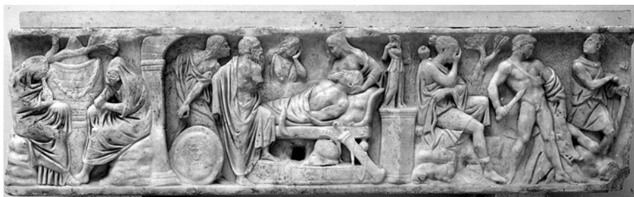
Figure 9.5: Meleager death-bed sarcophagus. Ostia, Museo Archeologico 101.