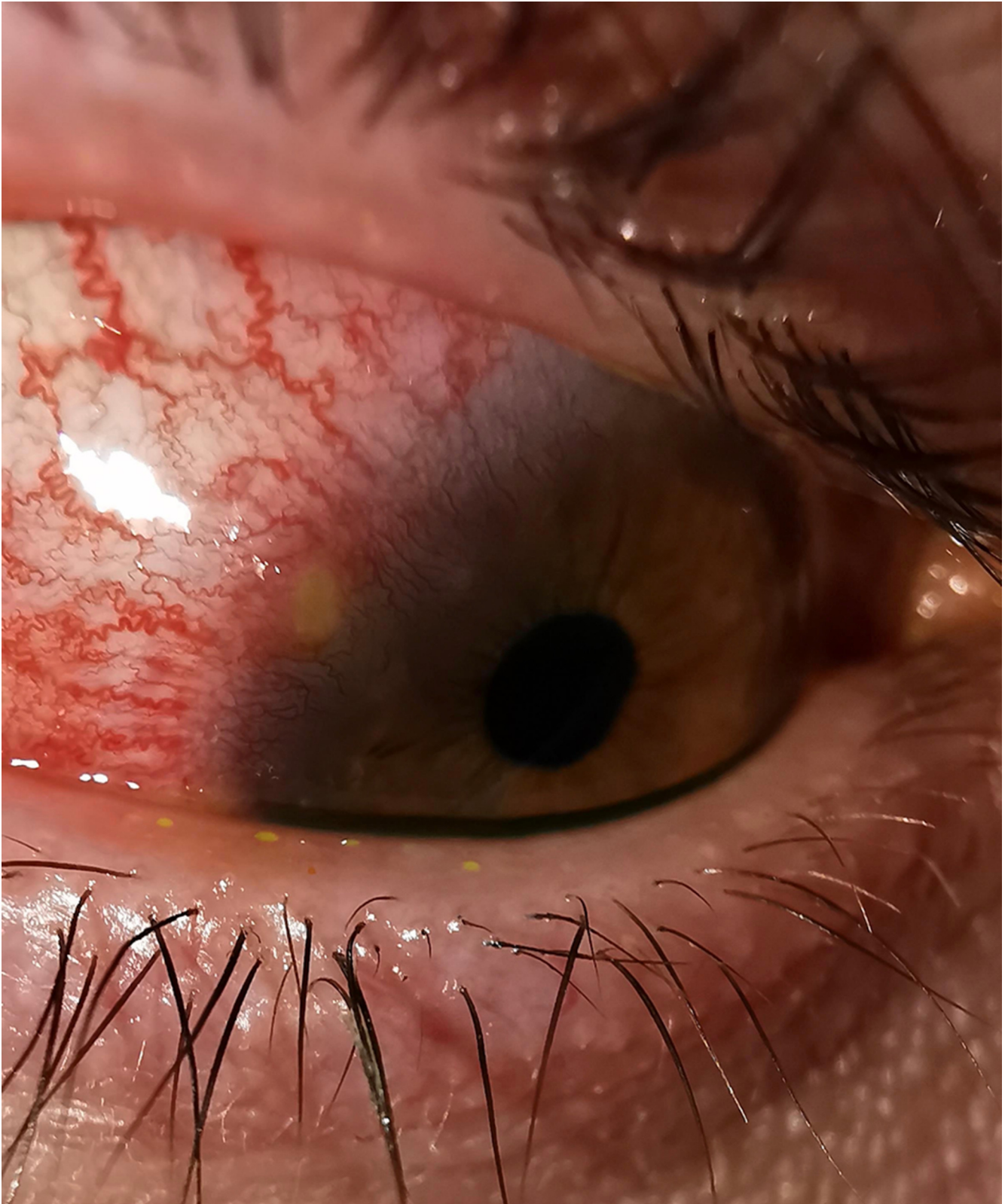
Fig 3 | A self taken photograph by a patient for a painful right red eye sent over a secure cloud-based platform. This patient was diagnosed with “keratitis,” evidenced by the presence of a white infiltrate at the superotemporal limbus and marked conjunctival injection

Pupils —Inspect both pupils for size, shape, position, and symmetry by asking patient to bring the device close to their eyes. Any difference in size or symmetry of the pupils (anisocoria) warrants