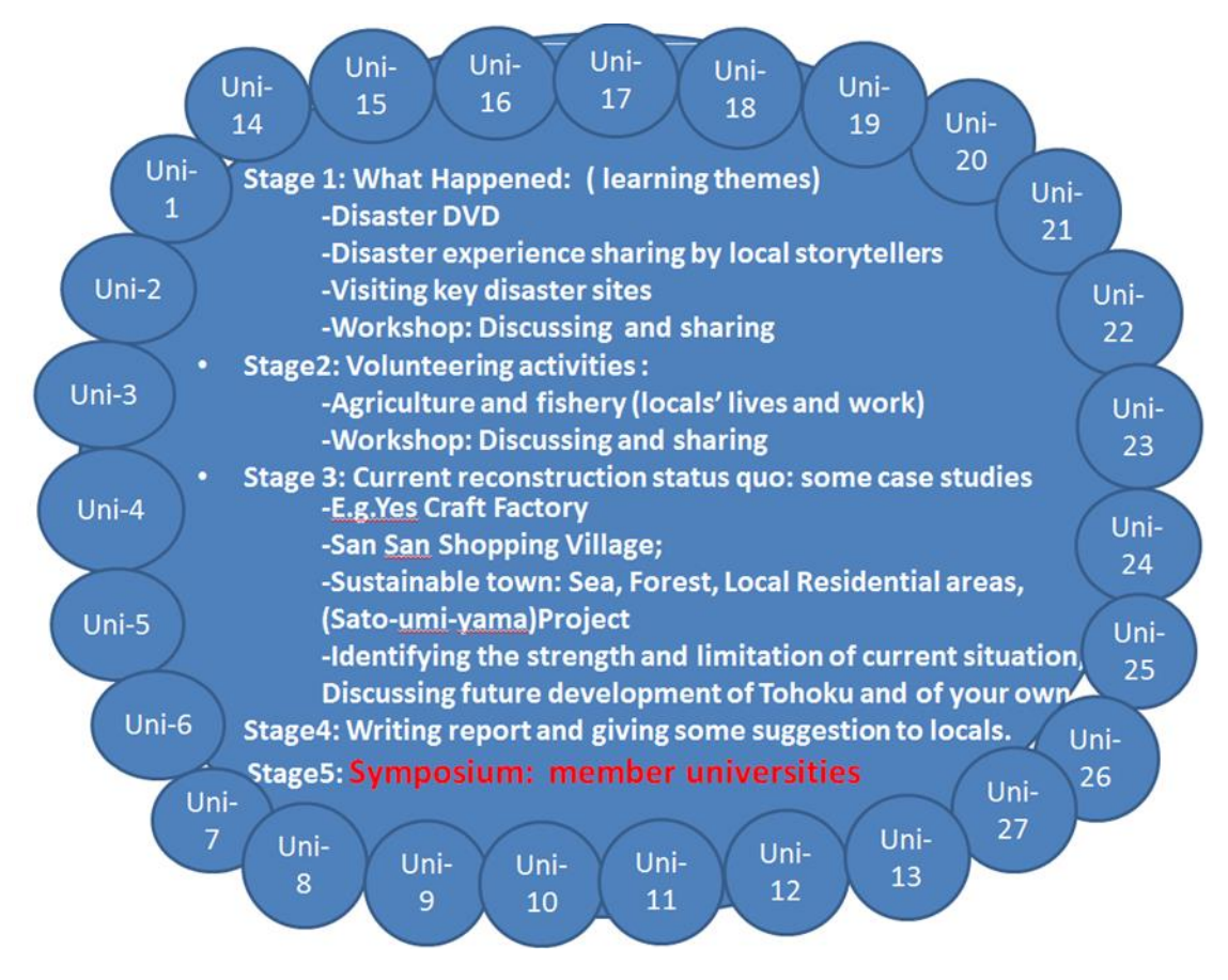
Figure 3: Tohoku Revitalization - Private Universities Network Sanriku「東北再生-私大ネット36」

Taisho University has demonstrated University social responsibility and set institutional norm for students. For example, immediately after disasters, Taisho University led 147 students and staff to participate disaster volunteer activities and 446 students for fund raising. Further support were provided by setting up Tohoku Revitalization-Private Universities Network Sanriku「東北再生-私大ネット 36」(Figure 3) in which 27 private universities joined the network with the aim of facilitating education, disaster recovery and regional development for a period of ten years: 2012-2022 (Taisho University website, 2012).