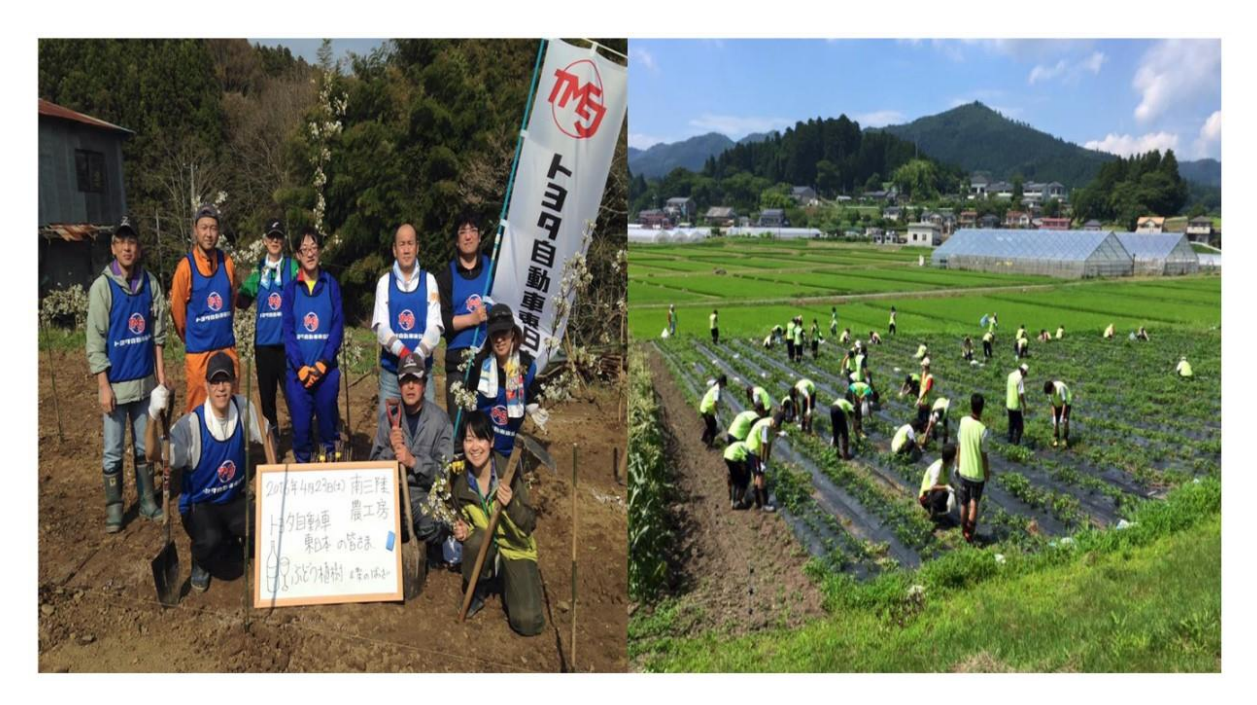
Figure 4: Employees from Toyota and students volunteering in the Agriculture Farm

The reflective field engagement creates connection between locals and outsiders, between human and nature. Their authenticity of support reduces the potential ethical issues caused by insensitive tourists and controversy around the exploitative or educational (Kingston, 2016). It also prevents from negative post-disaster tourism with prevailing holiday atmosphere by sitting in the hotel lobby to watch disaster video and do casual observation. Instead, such type of post-disaster tourism with explicit educational purpose and CSR engagement with students and other participants provide important communication channels to facilitate local sustainable practice.