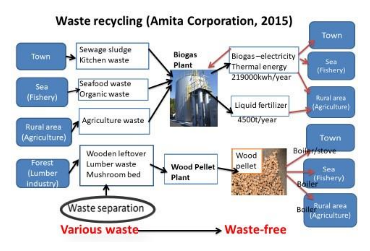
Figure5: adapted by the authors from the Minamisanriku Sustainable Circulation Vision

In addition, the town was awarded two highly competitive certifications of environmental sustainability in 2015 and 2016: FSC and ASC for responsible forests and aquaculture. To enhance public awareness of the sustainable vision, MLC has showcased local sustainable practices by organizing learning tours, holding workshops and providing training for local tourist guides. Students and visitors visit the Biomass plants, local forests and fishery farms to learn about the local resource circulation system and other local sustainable ways of living (Minamisanriku Learning Centre Website, 2016). It is unsurprising that the comments from the students are positive: