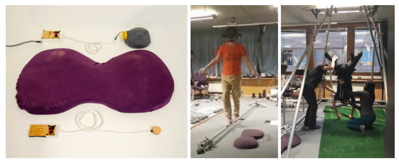
Figure 4. (left to right) a) Some Soma Bits that were used for exploring actuation on the body, b) tightrope prototype, c) flying harness prototype

balancing itself. The introduction of the Soma Bits made the 'feeling' of the act different, interrupting the flow state and bringing the balancer back to the immediate act of balancing. This suggests that such disruptions may be a way to equalise skill levels, to make an expert re-confront their process, or engage more deeply with the act rather than the goal.