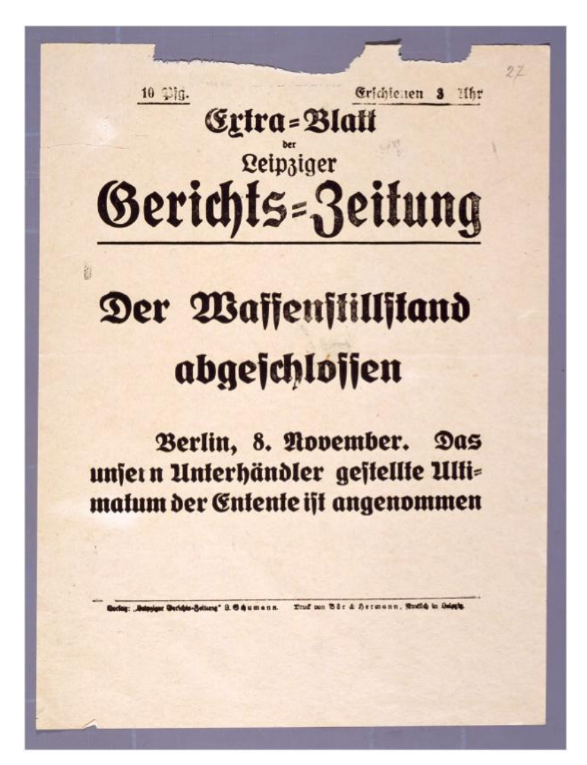
Figure 1. 'Armistice Accepted. Berlin, 8 November. The Entente ultimatum presented by negotiators is accepted'. Leipzig Court Journal. ^{VC} Deutsches Historisches Museum/S Ahlers

this intensity of emotion carried through to the supplement to the Leipzig Court Journal which read, in an arresting graphic that is reproduced here, 'Armistice Accepted. Berlin, 8 November. The Entente ultimatum presented by negotiators is accepted' (Figure 1).