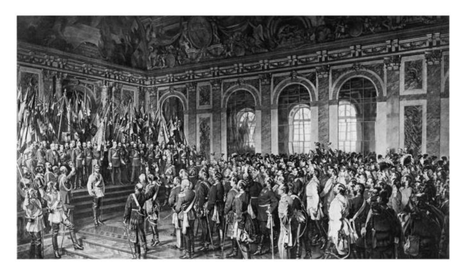
Figure 3. A von Werner, The Proclamation of the German Empire , Palace Version (1877)

the same breath, proceeded to outline their 'equitable' claims <sup>132</sup> as against those of Germany; or, at least, those equitable claims that Germany was assumed to have, <sup>133</sup> as it had not been given a recognised platform to make those claims known. So much for the 'free, open-minded and absolutely impartial adjustment of all colonial claims' that had been promised: Germany's 'overseas possessions' would now set sail on a different course, <sup>134</sup> 'such peoples form[ing] a sacred trust of civilization' as proclaimed by Article 22 of the Covenant of the League of Nations. <sup>135</sup> More problematic still was the projection of the 'interests' (as opposed to the 'equitable claims') of 'the populations concerned' whose 'exploitation should be conducted on the principle of the "open door". <sup>136</sup> Where, though, were the Tanganyikans, the Cameroonians, the Togolandese at Paris? How were their interests ever to be made known? Were they not entitled to speak of and for themselves? And why was what was