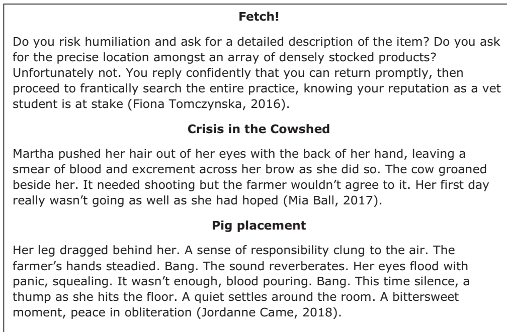
FIGURE 2 Short story prize winning entries