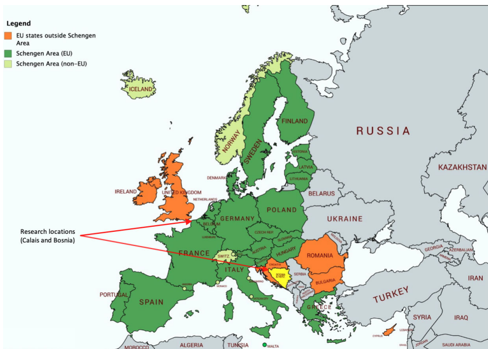
Figure 1: Map of Europe showing case study locations. At the time of writing the UK was still part of the EU. [Colour figure can be viewed at wileyonlinelibrary.com ]

It is in this space that our paper makes its contribution. This paper looks at the two aforementioned case studies of border violence used to securitise EU borders and suggests that although such acts of violence differ in manifestation, they