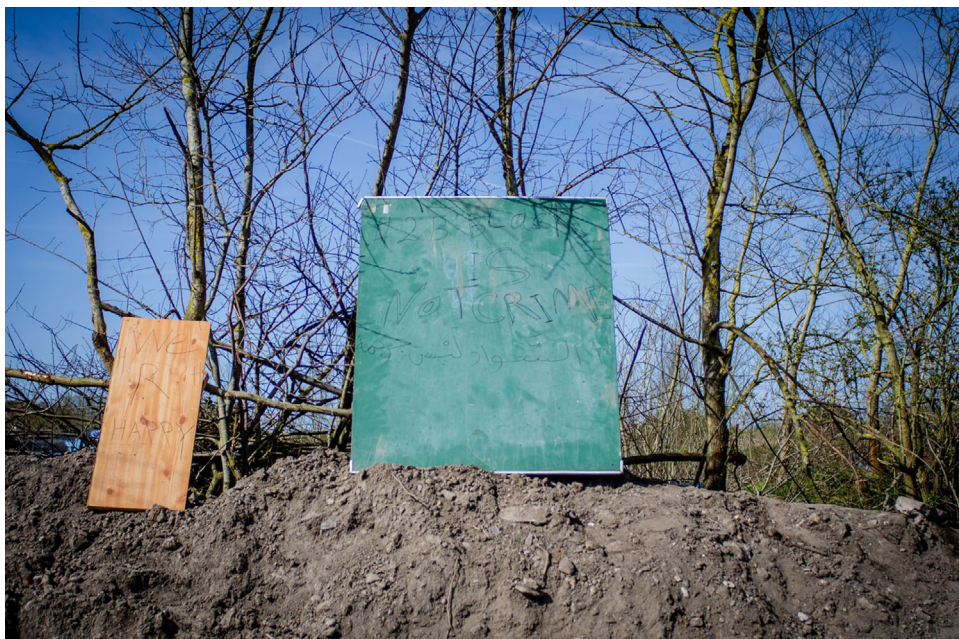
Figure 3: “2B Black is not a crime” written on a sign on the edge of the so-called Calais “jungle”, 2015. [Colour figure can be viewed at wileyonlinelibrary.com ]

If the violence of the camp in Calais can be stealthy, along Croatia’s borders with Bosnia and Serbia, a seemingly different violence operates, the hallmark of which