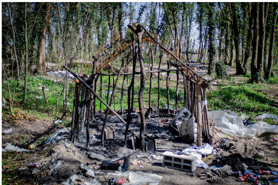
Figure 4: A refugee shelter on the outskirts of Calais recently destroyed by French police in a cyclical act of domicide. [Colour figure can be viewed at wileyonlinelibrary.com ]

The “Balkan Route” or the “Western Balkan Route”—as described by Frontex (El-Sharaawi and Razsa 2019)—came to prominence as immigration to Europe peaked during 2015. Our fieldwork indicates that the Balkan Route was initially an alternative to the more dangerous sea routes. Typically, refugees travelled from Greece, through Serbia, and then either through Hungary into Austria and then Germany, or through Croatia and Slovenia. Countries of the route themselves experienced outward and forced migration, particularly during the 1990s onwards, and this was felt acutely in Bosnia where the Muslim population was