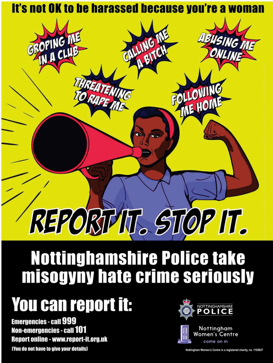
Figure 3. Nottingham Police take misogyny hate crime seriously.