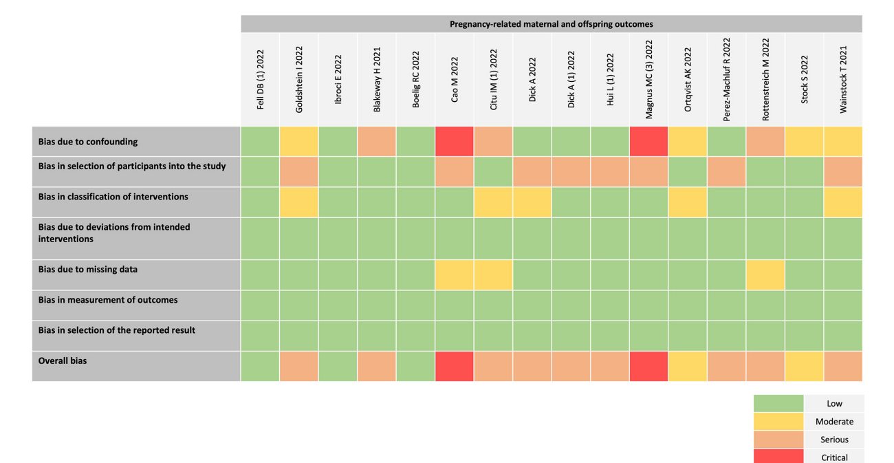
Figure 2 Quality assessment for risk of bias in studies of primary analysis using Risk of Bias in Non-Randomised Studies of Interventions tool. Created and owned by the authors.

other serious. For maternal hospital admission outcome, two studies were classified as having moderate risk and one as low risk. Of the two studies reporting neonatal SARS-CoV-2 infection, one study was considered to have critical risk of bias rating, as prematurity, a postintervention variable was used as an adjustment factor.<sup>18</sup> More than half of the studies reporting pregnancy-related maternal and offspring outcomes were considered to be serious risk (9/16), 19% (3/16) low risk and 12% (2/16) as moderate or critical risk. Online supplemental appendix 4 describes the consensus judgements used to assign the risk of bias in each domain.