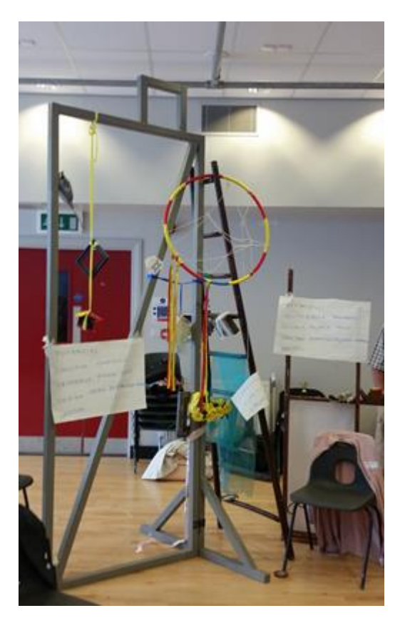
Figure two: Using Encompass's theatre space for co-produced activities.

Content analysis (Krippendorff, 1980) was used to analyse the data. All three authors read the transcripts, the observational data and the available documents independently and pinpointed recurrent themes. The authors then compared their initial interpretations and agreed on the main themes of change, co-production, communication and catharsis. Data, method and author triangulation was employed by the authors to ensure consistency between the information gathered via our chosen research tools. The use of data triangulation also provided a deeper understanding of Encompass's work through a comparison of multiple sources, giving the authors the opportunity to verify the accuracy of the information obtained (Holland, 1999).