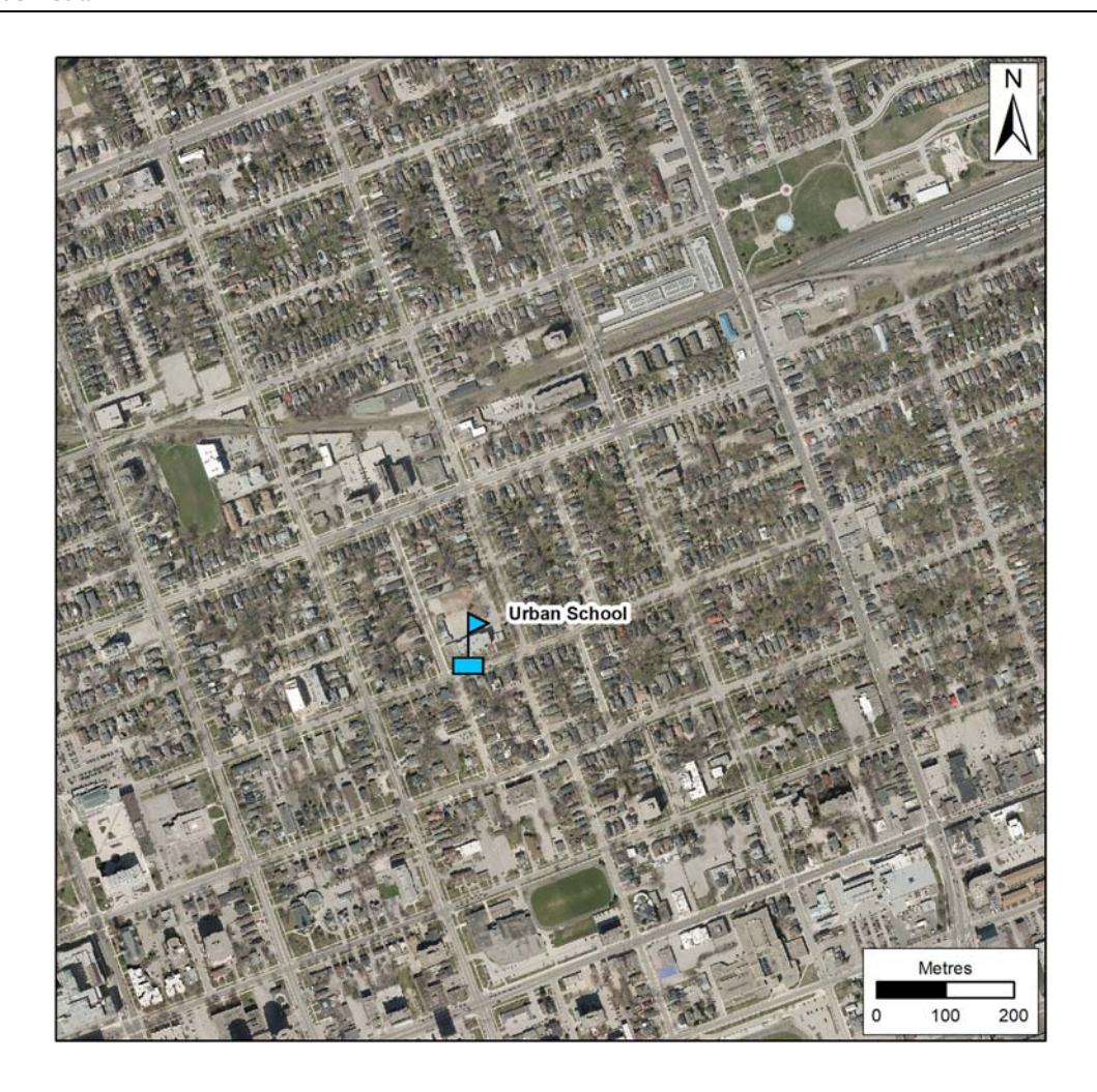
Figure 2 School B: urban neighbourhood.

particularly important enabling features, especially the familiarity of people, travelling to school with friends, and walking with a sibling—as one student from the suburban school commented, "I feel more comfortable when my friends walk with me and talk and stuff" (Figure 3, A). Seeing familiar faces en route and stopping at a friend's house to travel together were the two most common safety-supporting features students identified. Many students consciously selected certain routes to encounter other students, including one child who liked their walking route to their suburban school