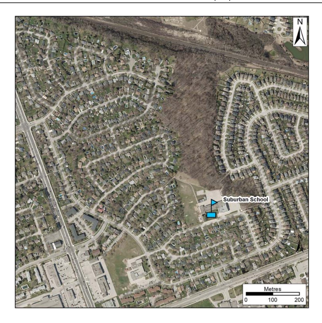
Figure 1 School A: suburban neighbourhood.