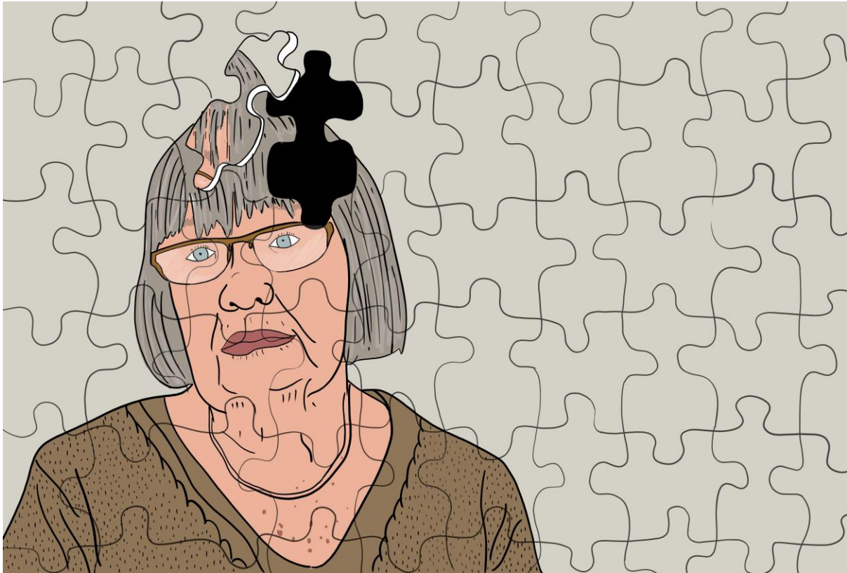
Figure 5. ‘Jigsaw puzzle, of a senior woman, falling apart’.

(Zimmerman, 2017: 73). Metaphors are thus double-edged: they might illuminate and vivify complex entities, but they are simultaneously prone to simplifying and exaggerating them.