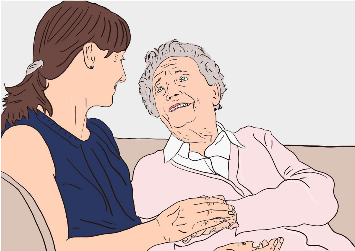
Figure 3. ‘Senior woman and caregiver’.

The ‘senior woman’ shown in this image is depicted in ways that can be contrasted with some of the more commonly reductive visual choices evident in the majority of the photographs in our data. In contrast to the disembodied hands depicted in Figure 2, we are granted a view of this woman’s face and most of her body. She is shown as smiling, engaging both visually and physically with the ‘caregiver’ sitting with her (a far cry from the socially-disengaged participant featured in Figure 1, whose face was emblazoned with an expression of fear and unhappiness and whose gaze was cast out of shot, vaguely directed at something out of reach, situated beyond the scope of the image). However, this kind of depiction in Figure 3 is relatively rare in the context of the photographic images in our data, with photographed participants pictured as visually engaging with either the camera or another participant in just fourteen of seventy-nine images and smiling or laughing in eight of these. Moreover, these