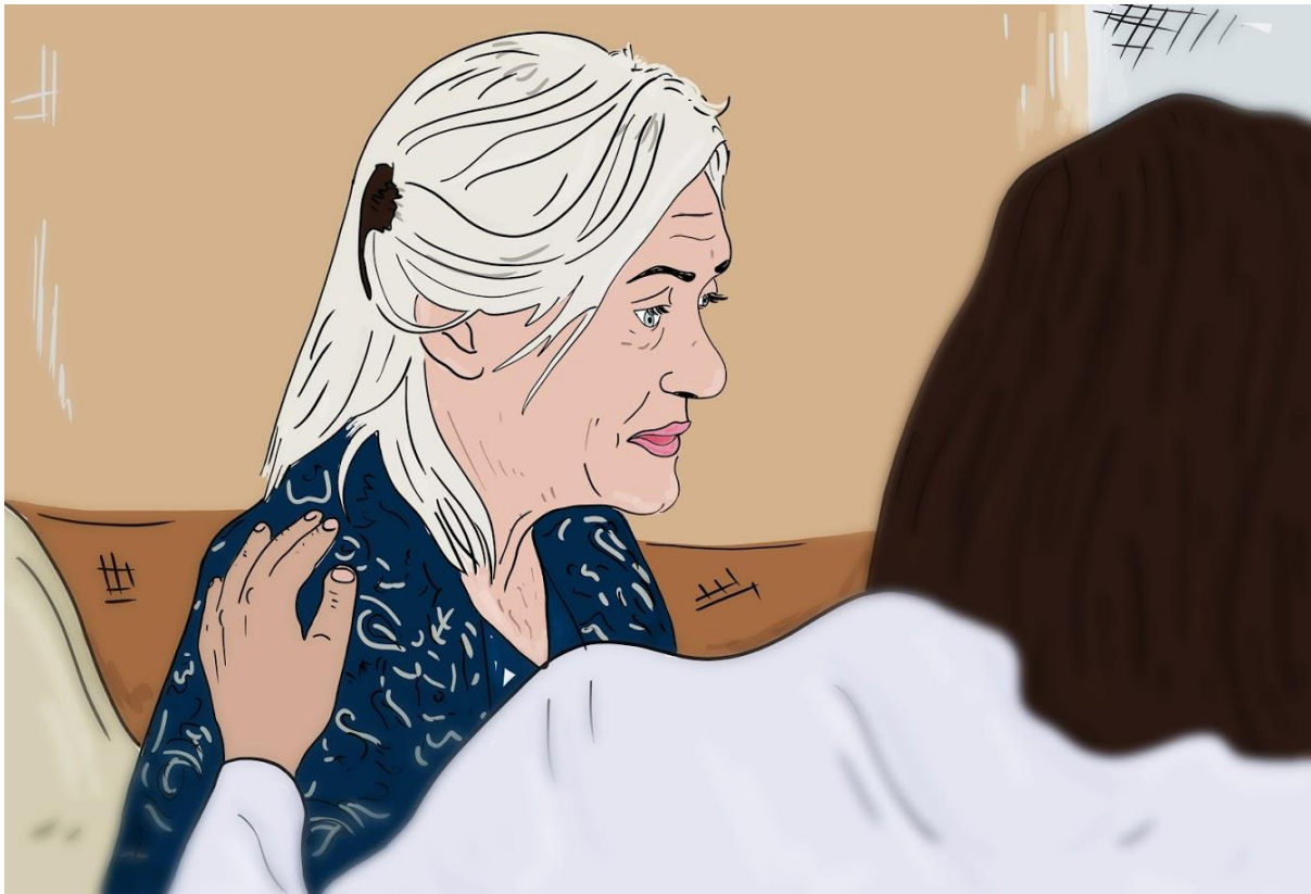
Figure 1. ‘Senior woman receiving help in old people’s home’.

back turned towards the camera (for she is not, in this image, the principal focus or subject), the participant performing the role of carer is seen in the act of lightly placing her left hand on the older woman's shoulder – a gesture quite clearly of support and what could perhaps also be taken as a sign of consolation.