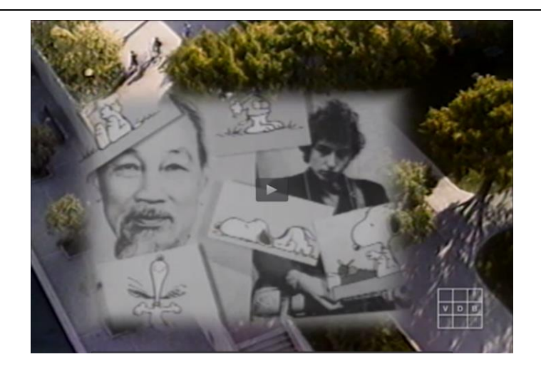
Fig 6: Ilene Segalove, The Riot Tapes (still), 1984, video, 30 minutes, colour. Image copyright of the artist, courtesy of Video Data Bank, www.vdb.org, School of the Art Institute of Chicago..