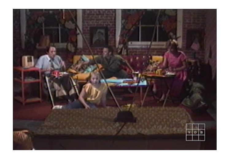
Fig 7: Ilene Segalove, The Riot Tapes (still), 1984, video, 30 minutes, colour. Image copyright of the artist, courtesy of Video Data Bank, www.vdb.org, School of the Art Institute of Chicago.