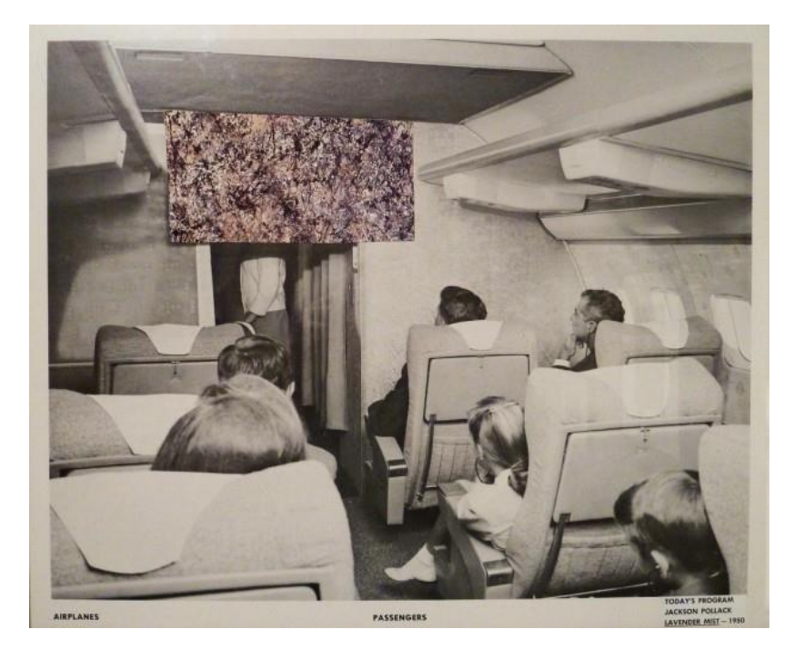
Fig. 1: Ilene Segalove, Today's Program: Jackson Pollock, Lavender Mist, 1950 , 1973, collage of offset lithographs, 35.6 x 43.2 cm (14 x 17 in.). New York, The Metropolitan Museum of Art, Purchase, Vital Projects Fund Inc. Gift, through Joyce and Robert Menschel, 2011. © Ilene Segalove.