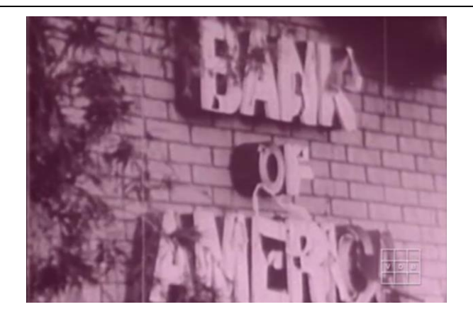
Fig 8: Ilene Segalove, The Riot Tapes (still), 1984, video, 30 minutes, colour. Image copyright of the artist, courtesy of Video Data Bank, www.vdb.org, School of the Art Institute of Chicago.