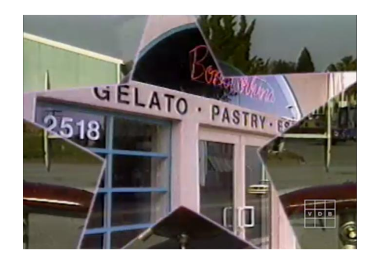
Fig 3: Ilene Segalove, The Riot Tapes (still), 1984, video, 30 minutes, colour. Image copyright of the artist, courtesy of Video Data Bank, www.vdb.org, School of the Art Institute of Chicago.

Fig 2: Ilene Segalove, I Remember Beverly Hills (still – title card), 1980, video, 28 minutes, colour, sound. Image copyright of the artist, courtesy of Video Data Bank, www.vdb.org, School of the Art Institute of Chicago.