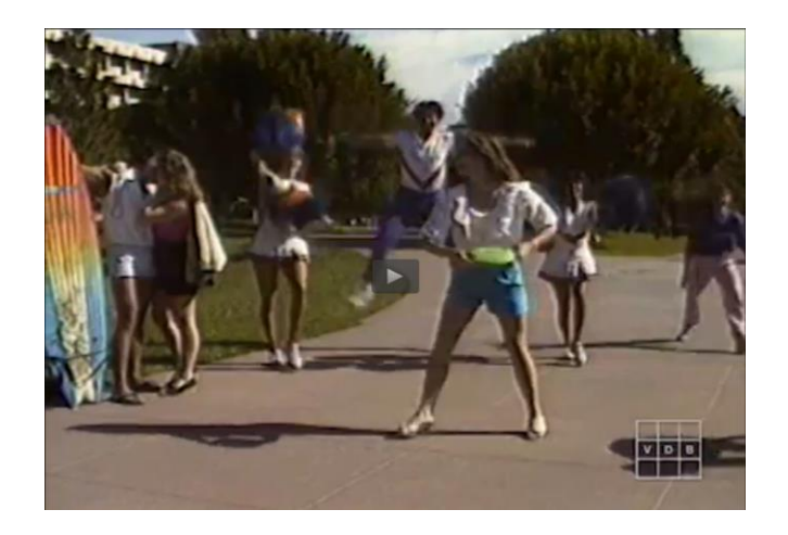
Fig 5: Ilene Segalove, The Riot Tapes (still), 1984, video, 30 minutes, colour. Image copyright of the artist, courtesy of Video Data Bank, www.vdb.org, School of the Art Institute of Chicago.

Fig 4: Ilene Segalove, My Puberty (still – title card), 1989, video, 11 minutes, colour, sound. Image copyright of the artist, courtesy of Video Data Bank, www.vdb.org, School of the Art Institute of Chicago.