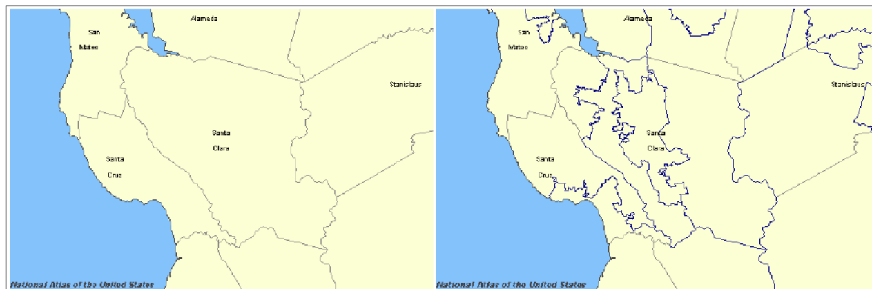
Figure 1: Santa Clara County: Congressional Districts

different districts, as it is exemplified by Santa Clara County in California (see Figure 1), which encompasses four congressional districts, some of which cover parts of neighboring counties. The second difficulty is that the geographic definition of districts changes over time, following each decennial Census, when districts are re-apportioned following changes in population.