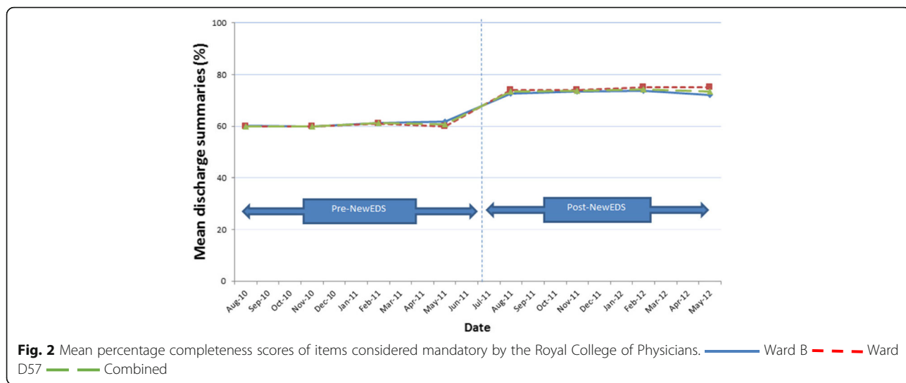
Fig. 2 Mean percentage completeness scores of items considered mandatory by the Royal College of Physicians. — Ward B — Ward D57 — Combined