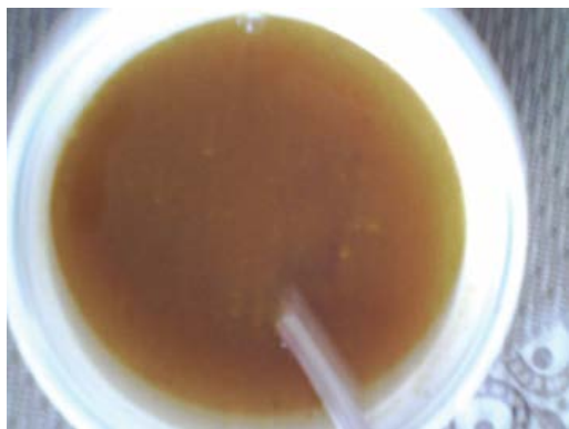
Jwano (thyme) soup (Nepali)