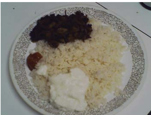
Urud dal curry, rice, and pickle (Indian, Tamil)