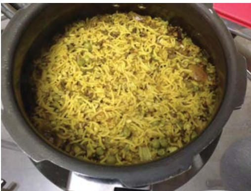
Vegetable khichrī (Indian, Gujarati)