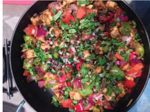
Paneer chili (Indian, Gujarati)