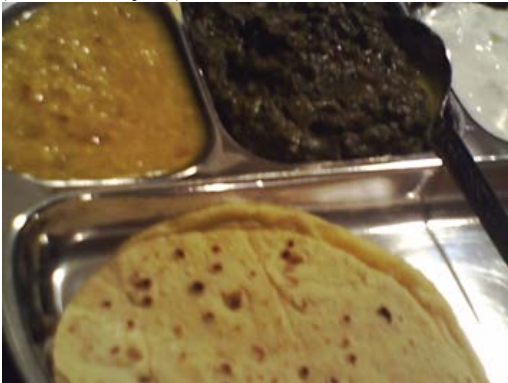
Roti, moong dal, spinach saag, and yogurt (Indian, Punjabi)