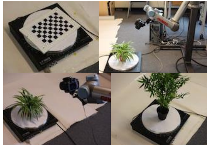
FIGURE 1. HARDWARE SETUP OF ROBOT, TURNTABLE AND CAMERA

We present a nonintrusive and nondestructive active vision approach to 3D plant modelling using a camera mounted robot arm and a turntable. The approach is based on a structure from motion method that derives 3D descriptions of the plant surface from sets of colour images. Our active phenotyping cell comprises a Universal Robot 5 (UR5), with a standard handheld camera, Canon 650D, and a high precision turntable, the LT360 EX. The UR5 offers 6 degrees of freedom whilst the turntable enables a full 360 degrees of rotation ensuring it is possible to see the entire plant, both of which are necessary as it is not always possible for the robot arm to move around the entire plant, for example a large rice plant. Our setup is illustrated in Figure 1.