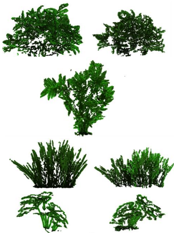
FIGURE 4. LEFT HAND SIDE ACTIVE VISION POINT CLOUDS, RIGHT SIDE STATIC. THE PLANTS FROM TOP TO BOTTOM ARE A, B, C, D

images of smoother (less textured) areas, allowing a greater degree of patch extension while making leaf boundaries more easily identifiable. This could be achieved by exploiting initial surface reconstruction data to guide acquisition of new images, rather than selecting them from a pre-acquired set as is currently the approach in [18].