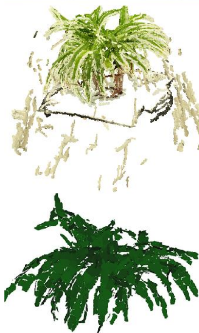
FIGURE 6. SURFACE RECONSTRUCTION OF A REAL PLANT FROM ACTIVELY ACQUIRED IMAGES. TOP; ACTUAL PLANT, MIDDLE; THE POINT CLOUD ACQUIRED, BOTTOM; SURFACE RECONSTRUCTION