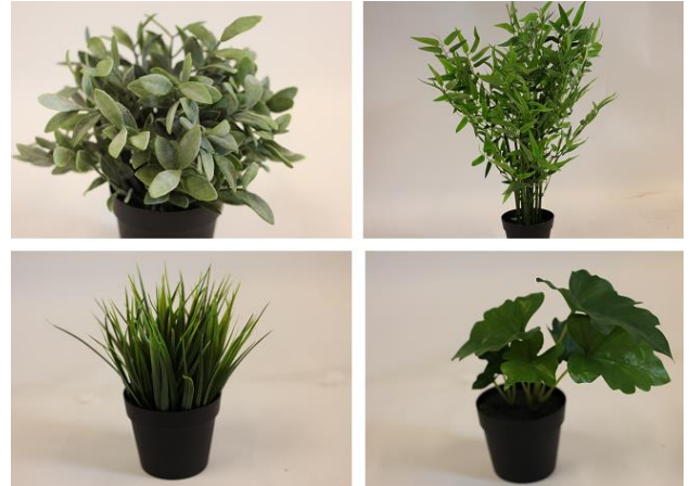
FIGURE 3. ORIGINAL PLANTS, TOP ROW PLANTS A AND B, SECOND ROW PLANTS C AND D

have manually removed, using Meshlab, the excess data obtained from under the plant, mainly from the plant pot.