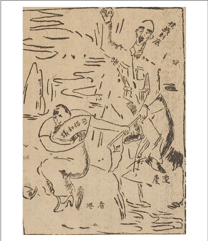
Figure 1. Untitled caricature of Chiang Kai-shek and Madame Chiang Kai-shek on the front page of Minzhong ribao , March 9, 1940. This image was reproduced in other newspapers in 1940.

It was in the period between the Japanese attack on Pearl Harbor (December 1941) and the Wang regime's declaration of war on the Allies (January 1943), however, that cartooning reached its apogee in RNG China. In the lead up to (and immediate aftermath of) the RNG's direct involvement in the Greater East Asian War, the Wang regime began to pay far more