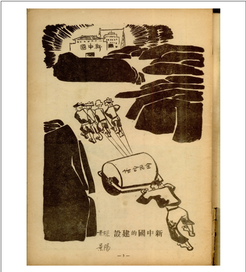
Figure 3. A propaganda cartoon calling on “all the people to cooperate” with one another under the Reorganized National Government. Yang Jing, “Xin Zhongguo de jianshe” (The building of new China), Zhongguo manhua 2 (Oct. 1942): 5.

like the walls of Manchukuo had done in Japanese visual propaganda a decade earlier (see Figure 3).