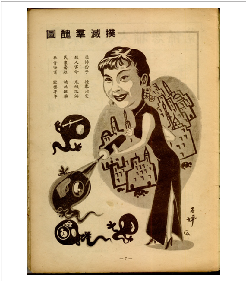
Figure 7. A “modern girl” helps rid Shanghai of (anti-Reorganized National Government) “terrorists.” Shi Ping, “Pumie qunchou” (Exterminate villains), Zhongguo manhua I (May 1943): 7.

cooperated with many of the most prominent of CCA artists, coauthoring film-related articles with Dong Tianye and contributing cartoons to many of the same publications as his peers in Shanghai and Nanjing. Huang’s oeuvre, however, represented the changing nature of cartooning in occupied China: in 1940, Huang was dismissing Chiang Kai-shek in the pages of Pingbao on the occasion of the Chinese Republic’s national day, drawing a series of cartoons that played on the standard trope of flight, showing Chiang as an isolated and