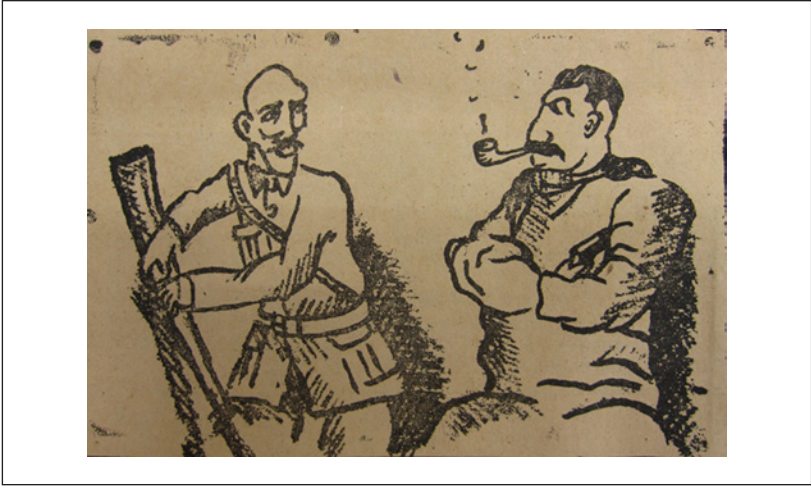
Figure 2. Wei Ru, “Yu zhengquan zhi molu” (The end of the road for the Sichuan regime). Published in Guofu huandu zhounian jinian tekan , 1941: 26.

attention to cartooning as a means of encouraging mass mobilization. Perhaps the clearest indication of this was the establishment of the Chinese Cartoon Association ( Zhongguo manhua xiehui ; CCA) in late 1942. In recognition of the central position of Shanghai in the Chinese tradition of modern cartooning, this body was established in Shanghai itself, operating out of offices on Peking Road (Beijing lu) in the heart of what had been the International Settlement. The CCA’s immediate predecessor appears to have been an organization referred to in Japanese as the Shanghai mangaka kurabu (Shanghai Cartoonists Club) (no date), a group which included among its ranks a number of China-resident Japanese cartoonists.