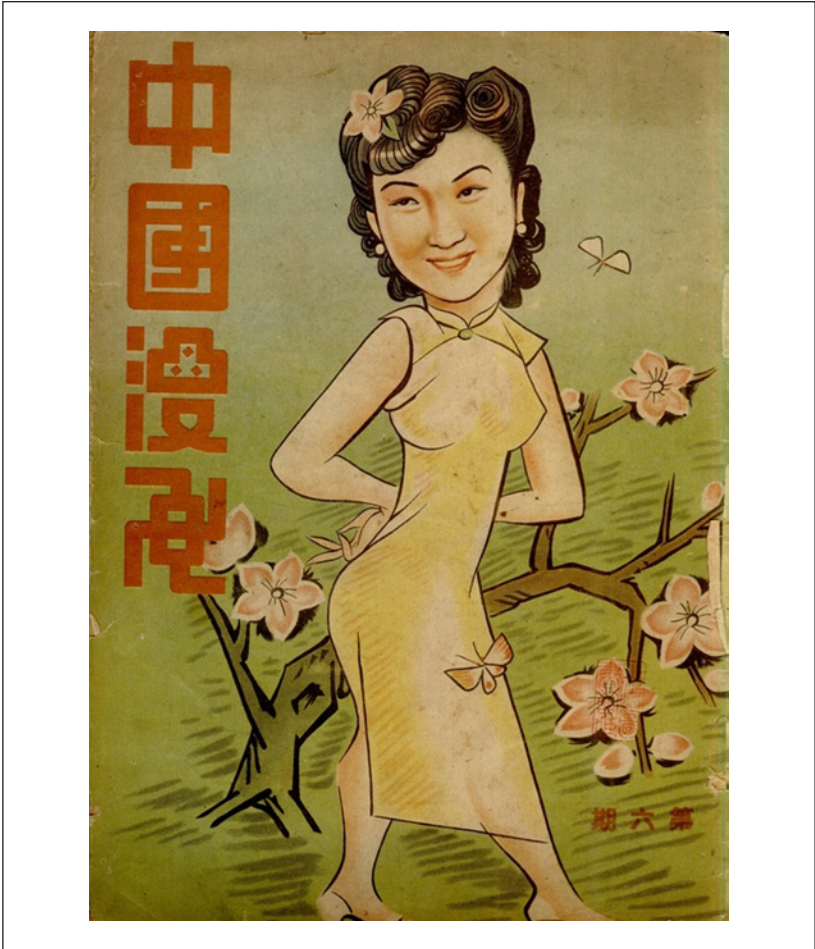
Figure 4. Actress Zhou Manhua, by Dong Tianye, on the cover of Zhongguo manhua 6 (May 1943).

the uniform of the Shanghai cabaret—the cheongsam. His cartoons of celebrated starlets drawn in this mode adorned the very cover of Zhongguo manhua on a number of occasions (see Figure 4). 16