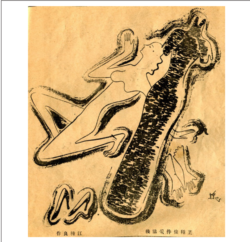
Figure 5. An example of Jiang Dongliang's sketches of the female form from the prewar period. Jiang Dongliang, "Mou zhong tiaojian tuoxie hou" (After certain conditions have been compromised), Qunzhong manhua 2 (April 1935).

the CCA (such as the production of visual propaganda for rural pacification campaigns), or perhaps even a deliberate trivialization of an art form which was being mobilized for the important work of rebuilding RNG China. Equally, however, one can find in these cartoons the central role that such images played in convincing an occupied populace about the return to normalcy (or even glamour) under Wang Jingwei's leadership. Like the return of attractive celebrities to occupied China's theater screens, images of dushi nüxing (urban women) in Shanghai newspapers had a very political purpose (see Figure 6).