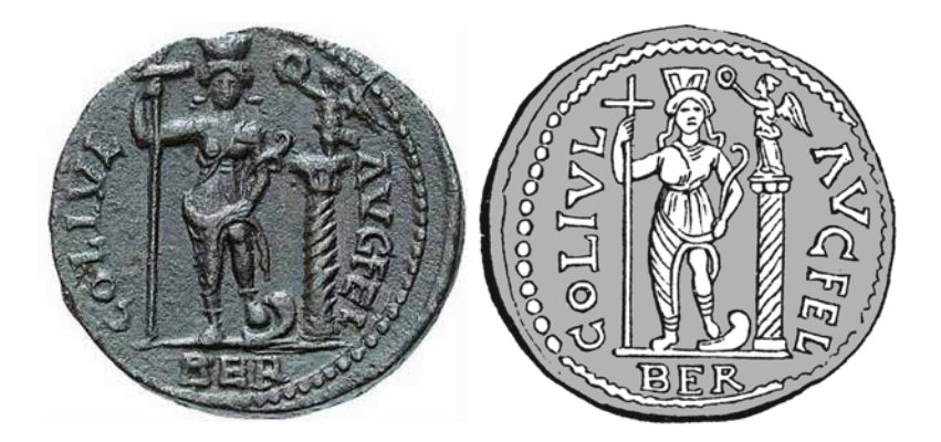
Fig. 2: Berytus under Valerian, 253–60 CE. d 28 mm, 18.3 g (twice enlarged). Reverse COL IVL AVG FEL BER. Tyche facing, being crowned by Nike on a column. Courtesy of Classical Numismatic Group, Inc., www.cngcoins.com. Electronic auction 181, lot 303 sold 06 Feb 2008. Drawing © A. Kropp.

with the bust of the emperor in her hand as an object of worship, she conveys a message of close allegiance to Rome.