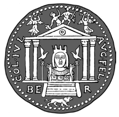
Fig. 4: Berytus under Gordian III, 238–44 CE. d 28 mm (twice enlarged). Reverse COL IVL AVG FEL BER. Temple of Tyche. within the temple, half-figure of Tyche facing; cornucopia and eagle on a pole to each side. On the roof, Poseidon snatching Beroe; at the sides Nikes holding up wreaths; at the bottom, a lion walking right. © A. Kropp.

to each side one winged cupid holding up a torch. The roof of the façade is crowned by four acroteria. Over the apex one sees Poseidon snatching Beroe, the eponymous nymph of Berytus, and at the sides Nikes are hold-ing up crowns with both hands.<sup>17</sup> At the bottom, to the left and right of the central stairway are cupids with tridents riding dolphins. There is also an impressive freestanding example of such a crowded assembly, the 'Laraire de Tortose' in the Louvre, a miniature bronze masterpiece from Antarados (Țarțūs).<sup>18</sup> Its constellation of figures corresponds closely to that on coins of Tyre.