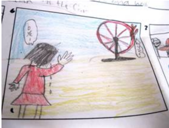
Figure 4: Sadia's little girl desires the rabbit and friendship

All the storyboards above were drawn by children for whom English is an additional language. This drawn mode enabled the children to articulate their rich understandings of narrative and their teacher to value them. Barrs (2000) describes the way in which children use aspects of the style and form of texts to help them in their story writing. Equally here the children were drawing on the particular semiotic affordances of the film text. In this case the children moved from being the audience to being the maker of text and by doing so used the text as a scaffold of ideas.