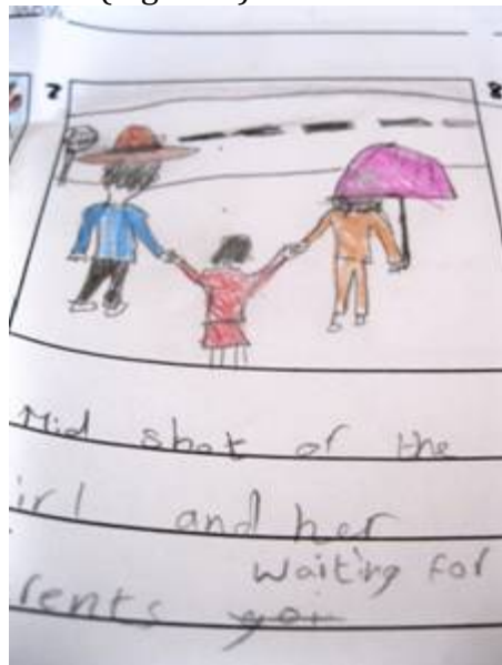
Figure 2: Maya's storyboard image based on the film Lucky Dip

used to describe the shots remained basic: they described long shots and close up shots but they drew point of view shots, low angle and over the shoulder shots (Figure 2):