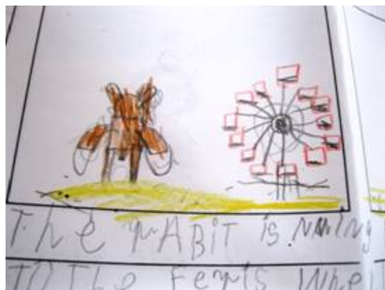
Figure 3: The rabbit is depicted here desiring the big wheel and freedom.

The shots drawn from behind the characters (adopting their point of view, seeing what the characters see), are evident in the original film but here the children have adapted them (see Figures 3 and 4). They have recognised that this shot shows both the character and their object of desire and also a degree of poignancy in terms of distance. They then used this structure but substituted different elements: