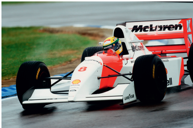
Figure 4 Substitution of Marlboro with McLaren on a McLaren F1 car in 1993.

occasionally even during the season. Furthermore, if it was a case of advertising branding, Philip Morris would have to own a legal copyright on it'. 59 An article on a motorsport website ( http://www.autosport.com/ ) quoted from a Scuderia Ferrari Marlboro press release, which said that criticism was 'based on two suppositions: that part of the graphics featured on the Formula 1 cars are reminiscent of the Marlboro logo and even that the red colour which is a traditional feature of our cars is a form of tobacco publicity...neither of these arguments have any scientific basis, as they rely on some alleged studies which have never been published in academic journals. But more importantly, they do not correspond to the truth'. 60