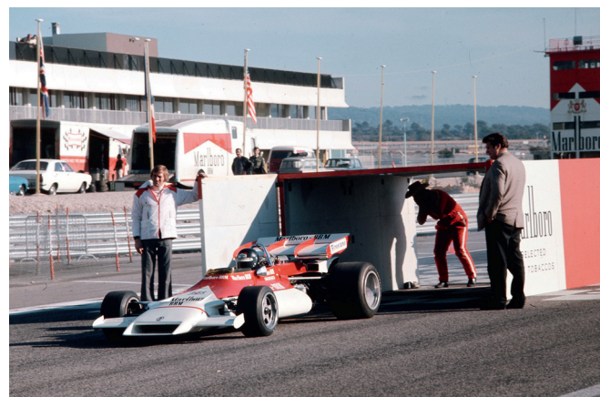
Figure 1 Marlboro branded BRM F1 car emerging from a mock-up of a giant Marlboro cigarette pack in 1972.

The Ferrari F1 team traditionally races in Italy's historic national motor racing colour, red. Philip Morris documents reveal that the company has long recognised the importance of association with Ferrari, and the red colour schemes shared by Ferrari and the Marlboro brand. Only once in F1 has Marlboro made use of a colour other than red, at the 1986 Portuguese F1 Grand Prix, when McLaren ran one car in a gold and white