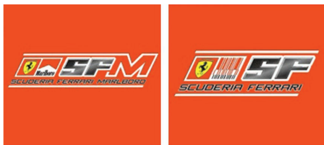
Figure 2 Ferrari F1 team names and logos, 2007 and 2010.

livery. This was to promote Philip Morris' new Marlboro Lights brand of cigarettes. The colour did not work on television and the experiment was never repeated. 33