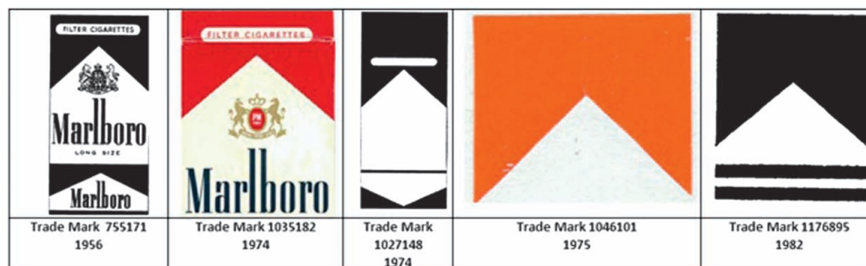
Figure 3 A selection of Philip Morris trademarks registered in the UK 1956–82.

When challenged by a series of media reports in early 2010 that the barcode design was in reality a Marlboro logo, Ferrari responded that 'the so called barcode is an integral part of the livery of the car and of all images coordinated by the Scuderia, as can be seen from the fact it is modified every year, and,