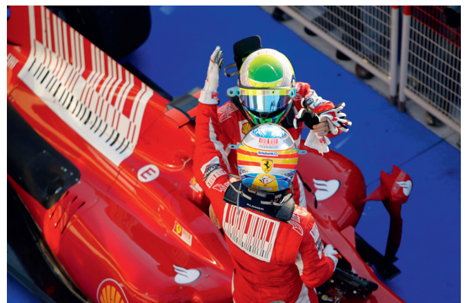
Figure 7 Marlboro 'barcodes' on both the Ferrari race car and the driver's clothing in early 2010 (LAT Photographic).

techniques known as 'trademark diversification' and 'alibi marketing'. 61 Trademark diversification involves the use of a cigarette brand name on the branding of other and typically unrelated products, such as clothing. 62 Alibi marketing involves distilling a brand identity into its key components, such as the distinctive red and white colouring associated with the Marlboro brand, or the shade of purple used by Silk Cut, and using these to promote the brand in place of a conventional logo or trademark. 63 This study was carried out to assess the validity of Ferrari's assertion that barcode design displayed on their F1