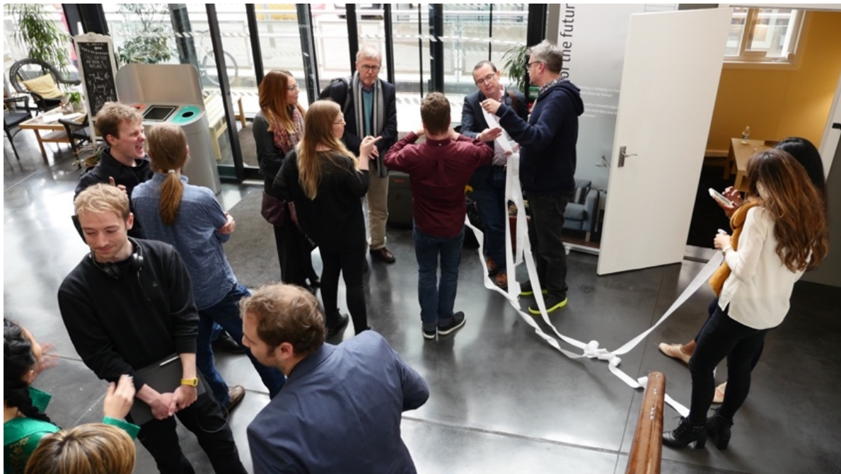
Figure 3. The LRoTF at FACT.

Subsequent analysis of the interview transcripts attended to the 'endogenous topics' (Pollner 2010) attended to and elaborated by participants and the interviewers in their talk together. Our analysis is thus framed around vignettes or conversational extracts that display the distinctive topics that populated discussion of the LRoTF, rather than external and/or a priori codifications. In short, our analysis thus attends to how our participants accounted for the LRoTF in responding to our broad areas of interests: