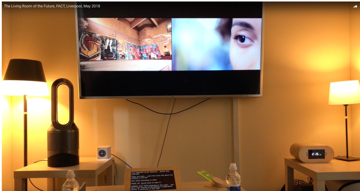
Figure 2. The LRoTF – an embodied design fiction for probing the future.

conscious exploration (rather than serendipity). At the end of the session the lights come on, the window blind is raised, and a receipt detailing the data generated by the audience to drive their experience is provided by a thermal printer built into the coffee table. The receipt highlights what items have been interacted with and their effect on the path taken through the film. It also highlights that all the data has been processed securely within the Databox and not passed to external parties. 1