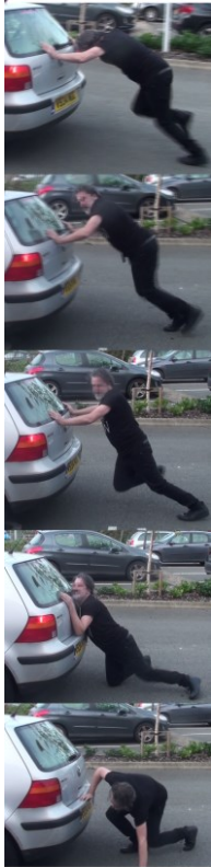
Figure 4 A player falls to the floor with exhaustion.