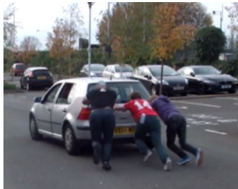
Figure 3 Multi Player GPA