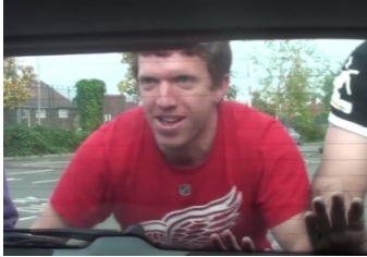
Figure 5 Pushing through the pain