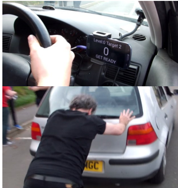
Figure 1. Driver and player in GPA

Car games have been a staple of gaming not only since the earliest days of arcades [14] and home consoles [1], but even in pre-digital board games [7]. Such games primarily celebrate one aspect of the car, the possibilities it gives for speed and driving excitingly fast. In our game, Grand Push Auto (GPA), we instead highlight the fact that a car is a very heavy lump of metal and other materials. For maximum realism, players must push a full sized, real car. The car engine is disabled at all times, as in GPA, the player is the engine whose target performance is controlled by the game. A minimum of two participants are required at any time, a driver and at least one player.