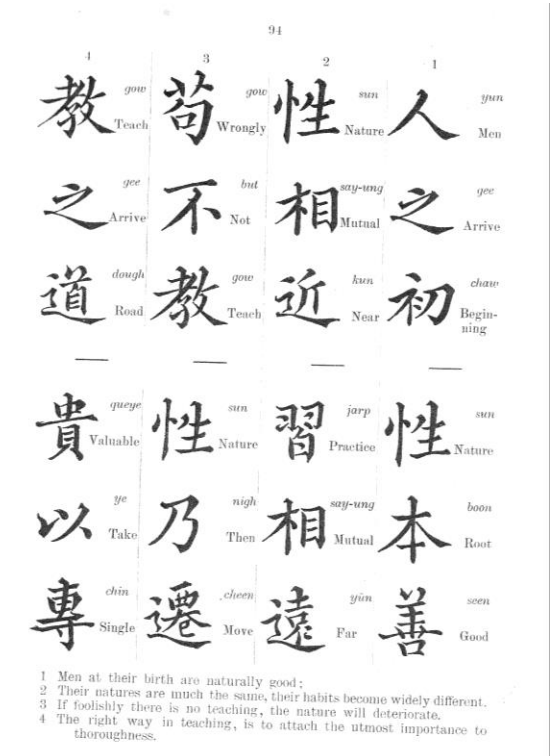
The Opening of the Three Character Classic in Brooks Brouner & Fung Yuet Mow 1904: 94)

the single-page solution arrived at by Brooks Brouner & Fung Yuet Mow (illustrated in Figure 1) is not used. In each case, the front of the book gives both the English translation and an adjacent English character-by-character paraphrase (see Figure 2), except for the three stories in Chapter XI.<sup>25</sup> Numbered footnotes supply the vocabulary (in character and romanization) and grammatical points needed for each numbered sentence.