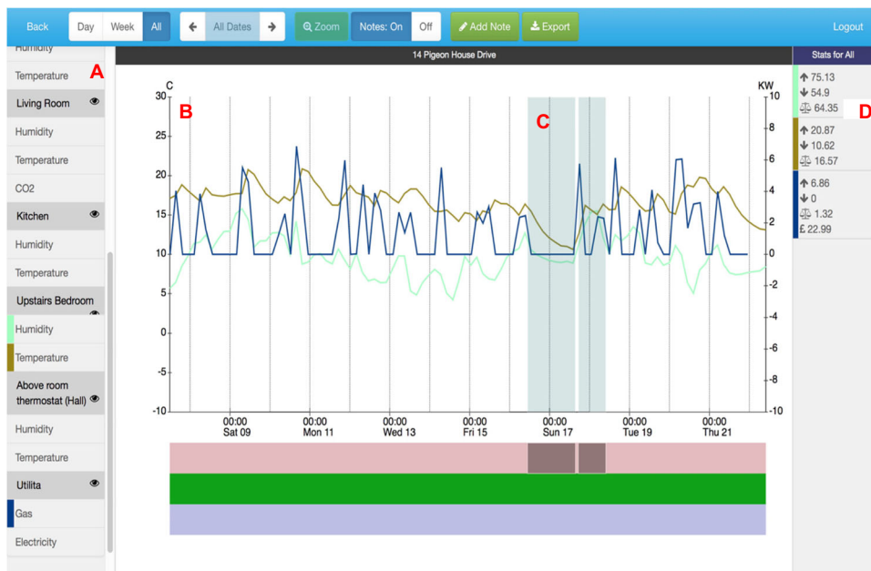
Figure 2. The interactive web app enables (a) filtering (show/hide) of sensor data sources, (b) pan and zoom time series line charts, (c) annotations (highlights) viewable on click, and (d) stats for selected sources (min/max, average, cost in £).

The CharIoT system was deployed in 10 UK homes in the Bristol area for three to four weeks over the winter months of 2015/16 after approval from our University's ethics committee. The deployment furnishes us with a field site to study the situated, collaborative accomplishment of data work. This section briefly describes the advisors' role, the participants in our study, the structure of the deployments, and data collection and analysis.