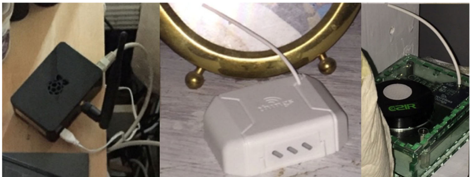
Figure 1. Hub (left), temperature/humidity sensor (middle) CO 2 sensor (right) deployed in situ.