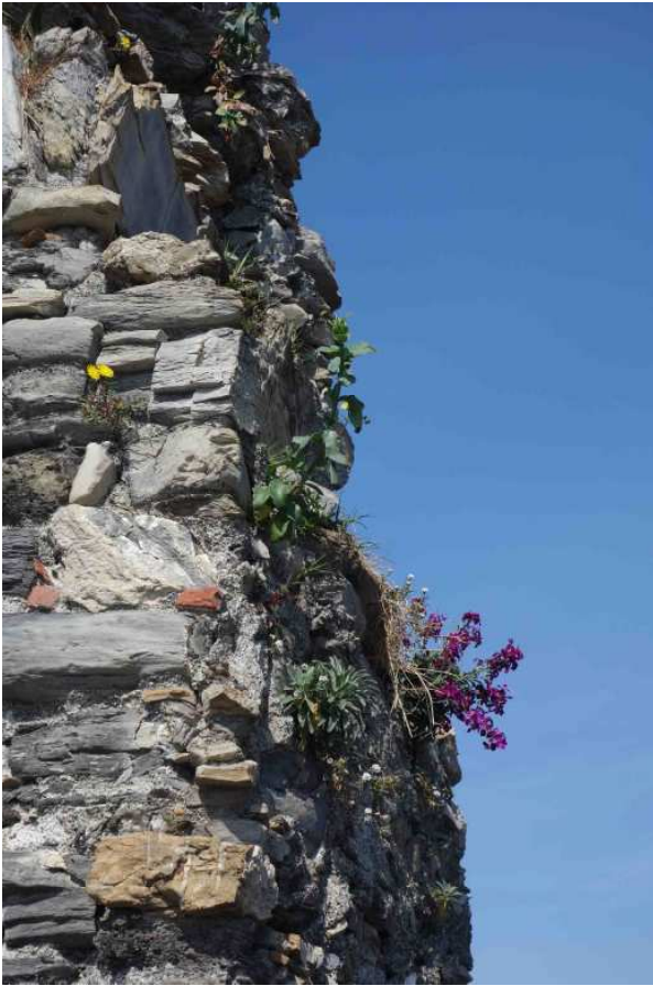
Figure 9 Matthiola incana L. (purple flower) and Lobularia maritima (L.) Desv. (white flower) on the West side walls of the promenade facing Genoa, below the Lanterna, June 2015 © R. Bruzzone.