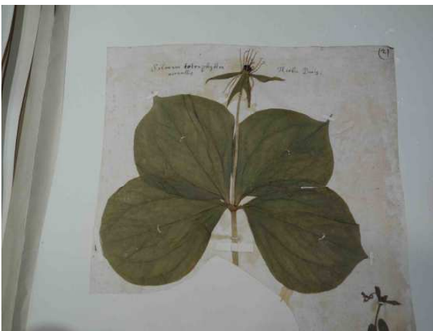
Figure 6 Herba Paris , Hortus Siccus Rayanus , Sloane Collection

The identification of the plants they collected at Genoa is not a simple task. First we needed to establish what had happened to the collected plants. Unfortunately not all the specimens survive and most of those that do seem to be from Sicily, where they later spent two months collecting plants. 8 Much of their collection of dried specimens is now found within the pages of a copy of John Ray's Historia Plantarum printed in 1686/8 held at the University of Nottingham. This is in five volumes and dried plants are mounted next to the corresponding description. 9 The production and preservation of this collection has a complicated history and it is likely that it was undertaken by Francis Willughby's children Thomas and Cassandra. The specimens collected from Italy are mixed up with plants collected in many other places including some from the Botanical Garden in Padua. Some dried specimens collected in Europe are now part of Ray's herbarium in the Sloane Collection at the Natural History Museum (London), in nine volumes of loose sheets known as Hortus Siccus Rayanus . 10 These plant specimens are also mixed from British and European travels and are mainly labelled with Ray's handwriting but also Skippon's. The herbarium has been used and modified through time and many of the specimens have been cut out as we can see in the example of Herba Paris (Figure 6). 11