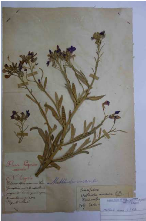
Figure. 8 Matthiola incana (L.) R. Br., 'Flora Liguriae exsiccata. N. Esposto. Cheiranthus incanus . Lin. Genuae in moeniis maritimis prope la Cava species sponte nascitur majo.9.1902. Esposto Nicolò'

Although most of the hillside and the surrounding semi-rural areas were removed during the twentieth century by quarrying and road and factory construction, there is still some vegetation immediately around the Lighthouse. In order to ascertain whether any of the species listed by Ray (1673) were still found on the rock we carried out five surveys between September 2014 and September 2015 at various times of the year and it was possible to identify nine species of plant on the rocks and walls that had been noted by Ray (Table 2) and an additional 28 species were also identified. 25 The survey was undertaken by following paths and access points on the Lighthouse rock which were all accessible to members of the public visiting the Lighthouse. A few areas were impossible to survey because they were dangerous to reach or covered by aggressive species like Ipomoea purpurea (L.) Roth and Rubus ulmifolius Schott (blackberry).