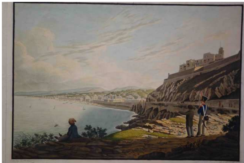
Figure 5 “Veduta del sobborgo di Sampiardarena al ponente della città di Genova presa dallo scoglio della Lanterna”, Luigi Garibbo (1812-14)