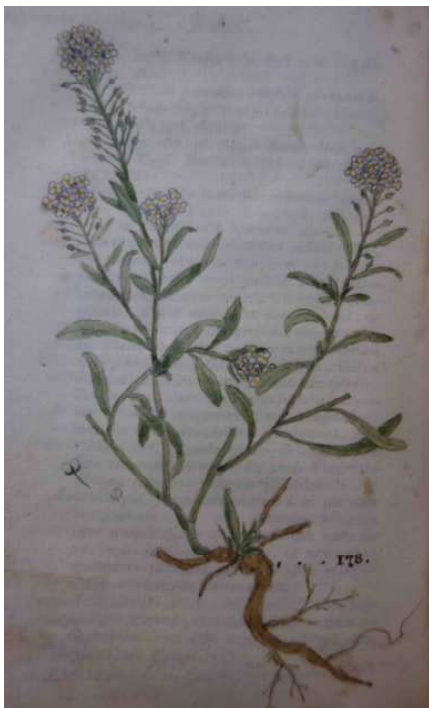
Figure. 7 178. Alyssum maritimum [...] In moeniis maritimis Genuae. Floret tota hyeme. Peren. alla Cava