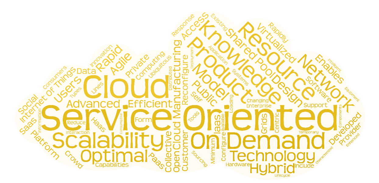
Fig. 1. Cloud manufacturing word cloud derived from [14, 15, 26-29]

"The cloud manufacturing model is the concept of sharing manufacturing capabilities and resources on a cloud platform capable of making intelligent decisions to provide the most sustainable and robust manufacturing route available."