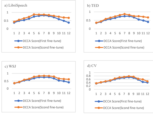
Figure 2: Layer analysis of wav2vec 2.0 with different pre-training and fine-tuning with I-CUBE data.

and then fine-tune with the target LR in-domain data. The results are summarized in Table 1, which shows that ScoutWav outperforms other models for both the I-CUBE and UASpeech datasets. The best performance is achieved after pre-training with LibriSpeech. This indicates a correlation between the model performance and the amount of pre-training data. In summary, adding contextual information to obtain local and global features enables ScoutWav to detect more accurate word boundaries compared to SN and chunk-based method.