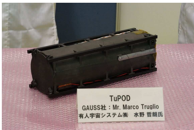
Figure 5: The Tu-Pod