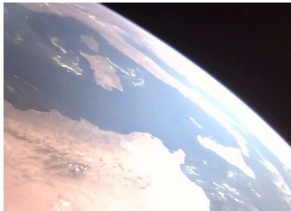
Figure 4: View of Italy and Northern Africa from the UniSat-6 camera