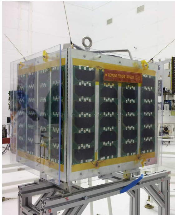
Figure 1: The UniSat-5 spacecraft at the integration