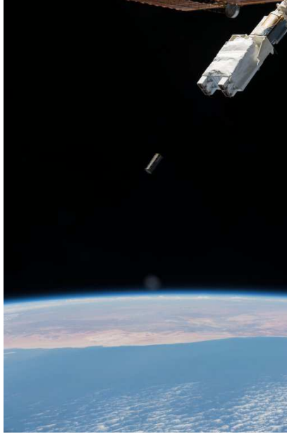
Figure 7: The Tu-Pod being released by the ISS

The ejection of the two TubeSats successfully occurred after three days from the release. The two TubeSats were regularly transmitting indicating the success of the main mission of the Tu-Pod. The spacecraft continued transmitting until its reentry in the atmosphere, which took place some weeks later, due to the very low orbit in which the Tu-Pod was placed.