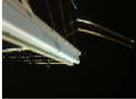
Figure 3: Tigrisat release as seen from the UniSat-6 camera