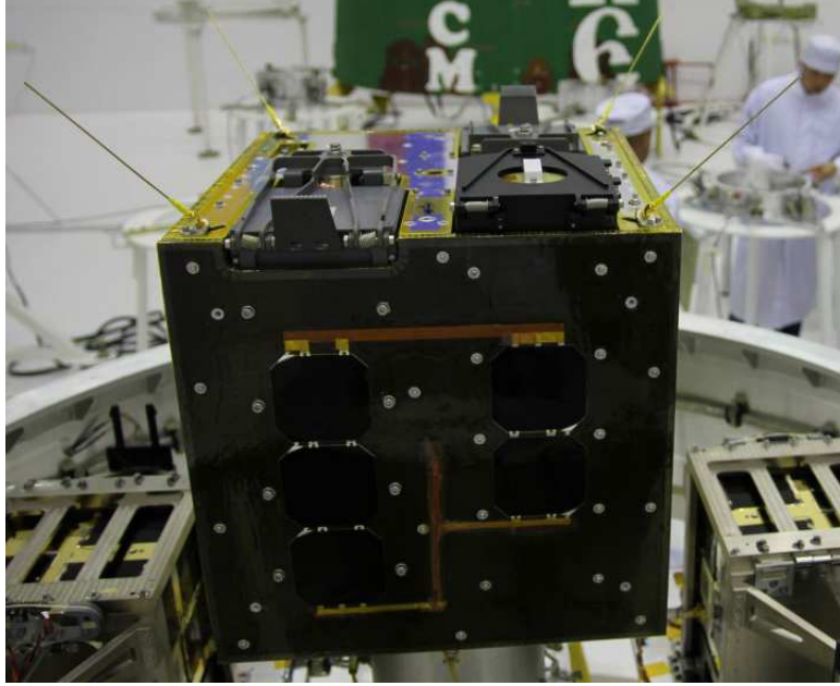
Figure 2: The UniSat-6 spacecraft integrated on the launch platform

Both satellites used the same communication system, consisting in a UHF radio and 4 antennas, and the same OBDH, based on the ABACUS computer (Nascetti, Pancorbo D' Ammando & Truglio , 2013). Both were designed to maintain an internal thermal range between -10^{\circ}C and 10^{\circ}C . Power is provided by body-mounted solar panels, which provide from 5 W (bottom panel) to 11 W (4 side panels) of electrical power.