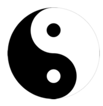
Figure 1: Yinyang representation

In the context of sustainability, long- and short-term practices can be represented by Yin and Yang. They coexist in all organizations, competing with each other for resources. Since it is usually easier for firms to see the benefits of implementing shortterm sustainability practices, they tend to focus most of their resources on such practices and neglect the long-term ones. However, with the development of sustainabilityrelated regulations and increasingly conscious consumers, firms cannot afford to completely ignore long-term sustainability. As a result, how to balance short- and longterm sustainability like Yin and Yang to maintain a dynamic equilibrium is a challenge for firms.