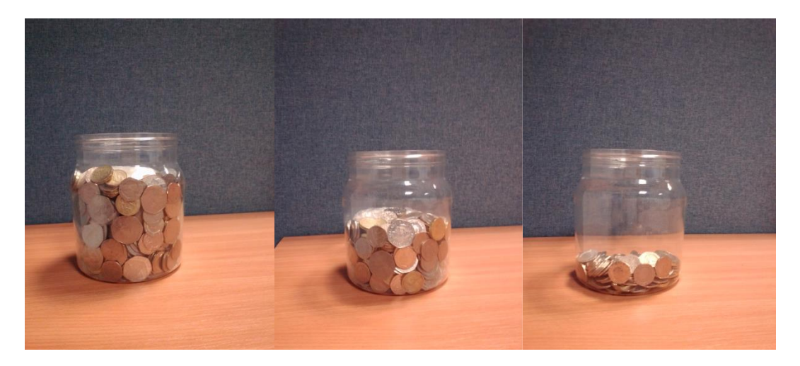
Figure 1. Example of the 80%, 50% and 20% full jars of coins.