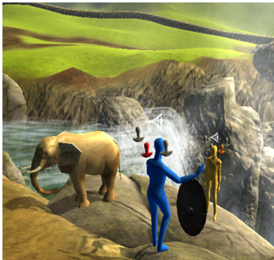
Figure 1 Reconstruction (with permission) of a group VR session depicting the participant's (yellow avatar, background) relationship to another individual (blue avatar, foreground). The participant represents their precarious relationship at the edge of a cliff next to the waterfall. They also use a shield to represent protection strategies (safety behaviours) in relation to this other individual. The floating heads around each avatar represents different internal monologues that the participant has attributed to themselves and the other individual. Furthermore, the participant has used the elephant object to represent 'the elephant in the room' in terms of what is not being discussed between the two individuals.

participants were in the early stages of their therapy, while the remaining five participants were in the later stages, two of which were nearing the end of their therapy. All participants had received, at least, an introductory period of 10 weeks of therapy prior to participating.