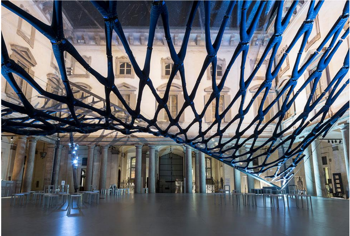
Figure 9: View of the pavilion at night