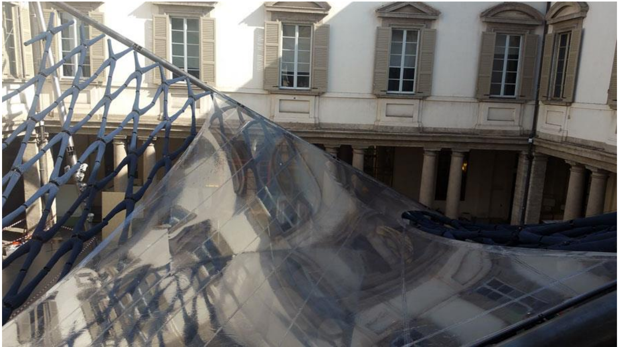
Figure 8: View of the clear PCV foil applied on top of the pavilion