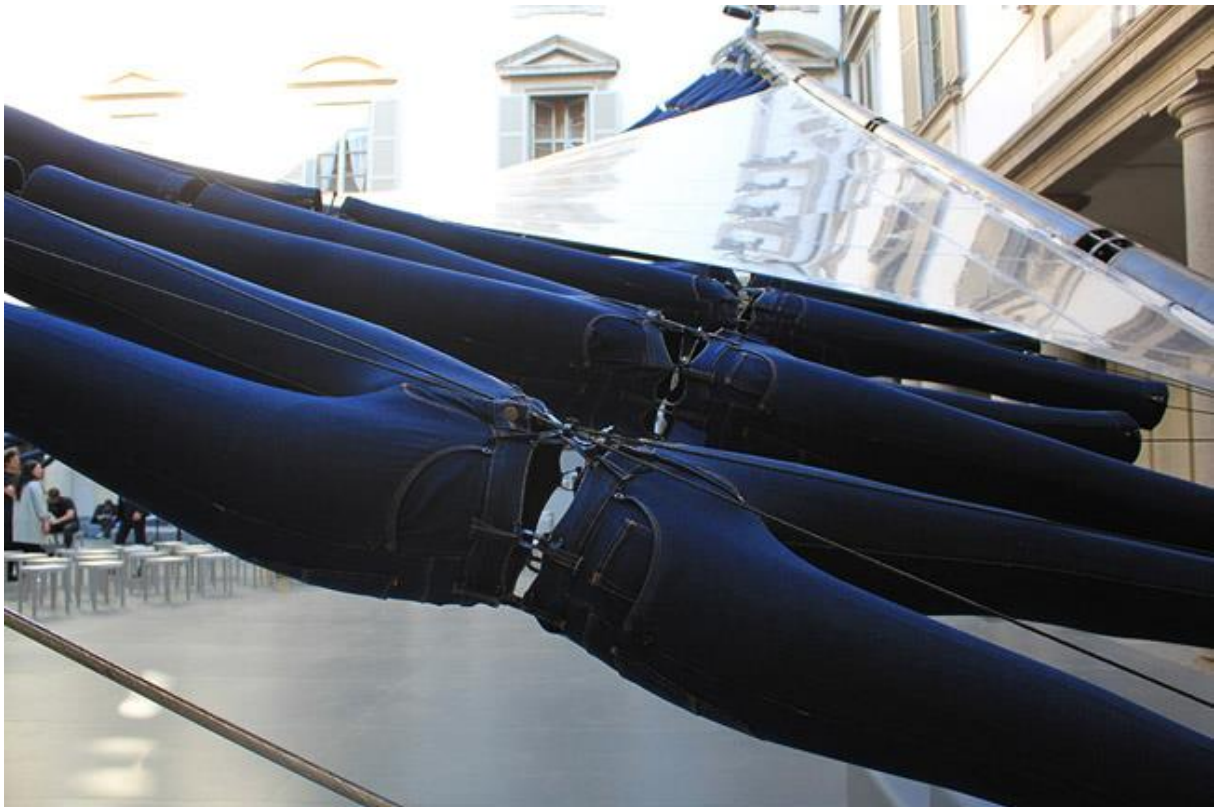
Figure 7: Detail of the structural connection between the thrusters