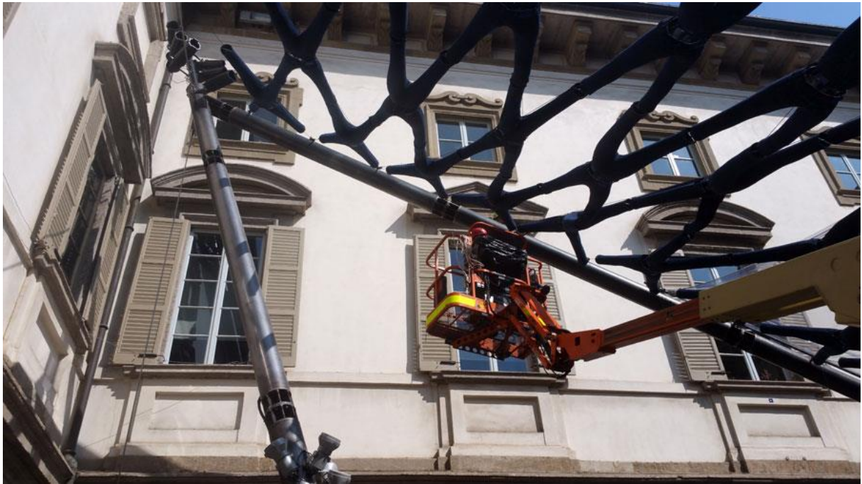
Figure 6: Final adjustments of the level of pretension introduced in the mesh.