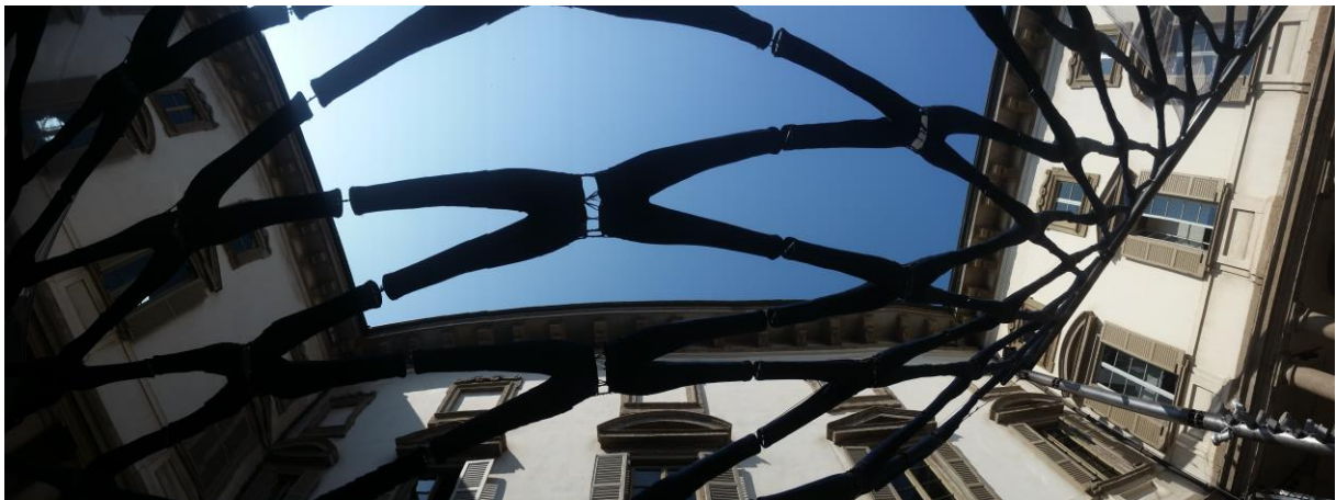
Figure 9: View of the mesh for underneath.