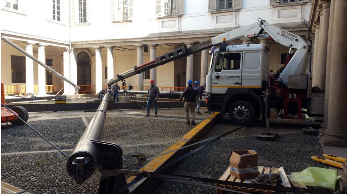
Figure 5: Installation of the steel structure. Detail of the Lifting of the steel posts 3 .

spread the load in order to reduce the risk of damages to the ancient floor made of pebbles stones.