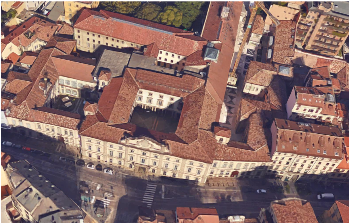
Figure 1: View of Palazzo Litta, location of the exhibition ‘A Matter of Perception: LINKING MINDS 2017’. The palace is placed in in the 5VIE design district.

Maco Technology and the University of Nottingham were contacted in January 2017 in order to provide the support for the final engineering, manufacturing and installation of the pavilion by the 3 rd of April 2017.