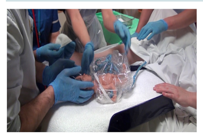
Figure 5 Demonstration of how to set up the LifeStart trolley for neonatal care beside the mother immediately after birth at vaginal births