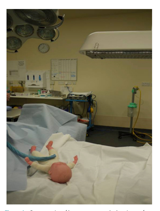
Figure 4 Demonstration of how to set up standard equipment for neonatal care beside the mother immediately after birth a caesarean section.

At vaginal births adjust the height of the platform so that it can rest on the mother's bed (figure 5). At caesarean section wheel the trolley end on to the operating table and adjust the height of the platform to the mother's thighs (figure 6). For both types of birth, the trolley is located with the neonatal interface facing the neonatal team.