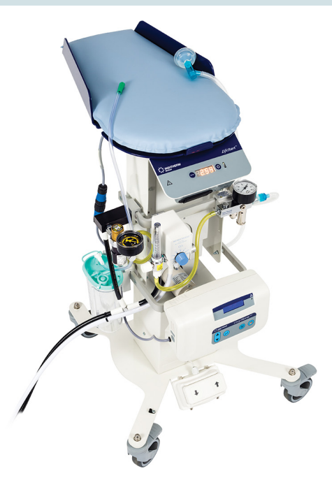
Figure 1 The LifeStart trolley.

standard equipment (the Draeger Resuscitaire and Fisher and Paykel CosyCot) and the LifeStart trolley. The set up required for each of these platforms is slightly different.