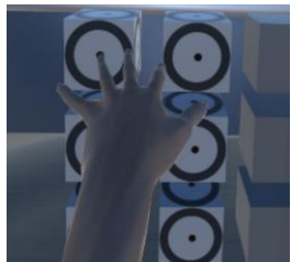
Figure 3: A timed target-touch task from the currently ongoing study.

movement, which mapped the real human data onto an avatar displayed in the virtual environment. Kinect is a cheap and affordable optical system that captures depth data for human skeletons, and the SDK for Unity has human kinematics which allow it to control a human avatar in Unity. Leap Motion is the only non-contact finger skeleton and kinematic system that is widely available and cheap. Unity is a free and seat-licensed software that has large public support for codes, ideas and extensions to support new development. Unity integrates graphics and coding with features like direct control of graphics animation via code, which improve the development cycle and provide better control for design iterations. We used the Oculus DK2, an affordable off-the-shelf Head-Mounted Display (HMD) with head-tracking capacity.