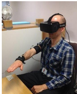
Figure 2: "Sensory illusions" prototype.