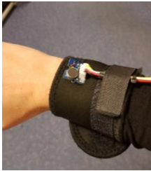
Figure 1: Early version of the vibrotactile device.