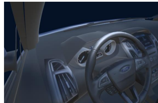
Figure 4: VE for current investigation (automotive use case).

An ongoing current study (Figure 3) investigates participants' performance in spatial tasks in a VE using the sensory illusions prototype compared to a system with no haptic feedback, to establish the potential task performance benefits with haptic feedback. Results so far suggest that participants make fewer errors in spatial judgements with the sensory illusions system.