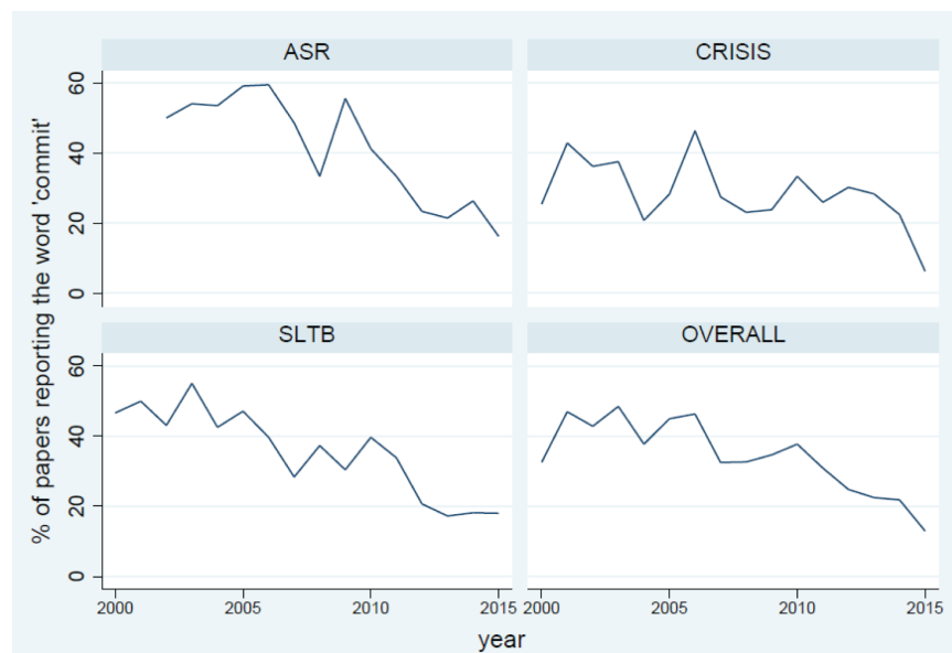
Figure 1. Percentage of papers reporting 'commit*' in relation to suicide or self-harm behaviours, by journal (2000–2015), p -value for trend < 0.001 . Note: Instances in which 'commit*' is directly quoted (e.g., in qualitative interview data that is reported to support a theme) are excluded from this count. ASR, Archives of Suicide Research; SLTB, Suicide and Life-Threatening Behaviour.

As individuals we each hold a position of power and responsibility. As researchers, clinicians and suicidologists we hold a collective responsibility for the language we propagate and the messages this imparts. Therefore, we believe that the phrase 'commit suicide' should be avoided in all arenas, including clinical and professional practice, teaching, when interacting with peers, colleagues and the general public, in our everyday lives and, importantly, in our academic writing. While it is noted that in the 25 countries in