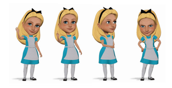
Figure 3: Samples of Alice expressive posing.

ence demo setting, i.e. multiple people interacting with it, or a user suddenly addressing one of their colleagues instead of Alice, or a user simply walking away from the interaction mid-interaction.