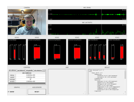
Figure 2: Input Block Visualisation

It is responsible for making queries to its domain-knowledge database to answer questions. Once all goals and states are taken into account it decides on which intents the agent should express and which information it will give, generating an FML message. The Output block generates the agent behaviour, that is, it synthesises speech and visual appearance of the virtual human. The ARIA Framework makes use of communication and representation standards wherever possible. For example, by adhering to FML and BML we are able to plug in two different visual behaviour generators, Greta [4] or Cantoche's Living Actor technology.